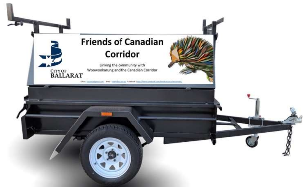
Artist’s impression of the tool trailer.

The trailer will be used to transport and store the FoCC’s tree planting tools and equipment. A private lock up home has been found for the trailer. Expected delivery is late October.