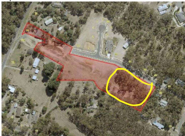
Map of the Site courtesy of the Courier August 1 2025. Annotation by the FoCC.

An application to clear 0.75 hectares of Koala Habitat has been lodged with the City of Ballarat Statutory Planning department.