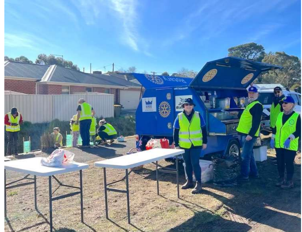
The wonderful Rotary BBQ set up at Lal Lal Drain 3rd August 2025.

Many thanks to the wonderful Rotary volunteers who helped make the planting go exceptionally well.