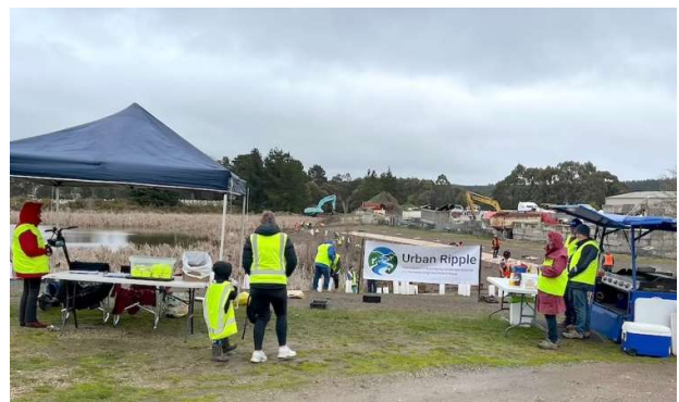
Rotary Sausage sizzle at Soapy's Dam. 31st August 2025