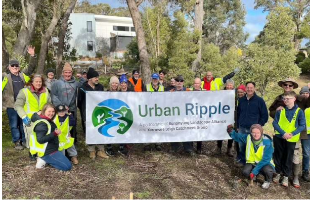
50 volunteers planted 300 plants along Sailors Gully reserve Mt Clear. Image 17th August 2025