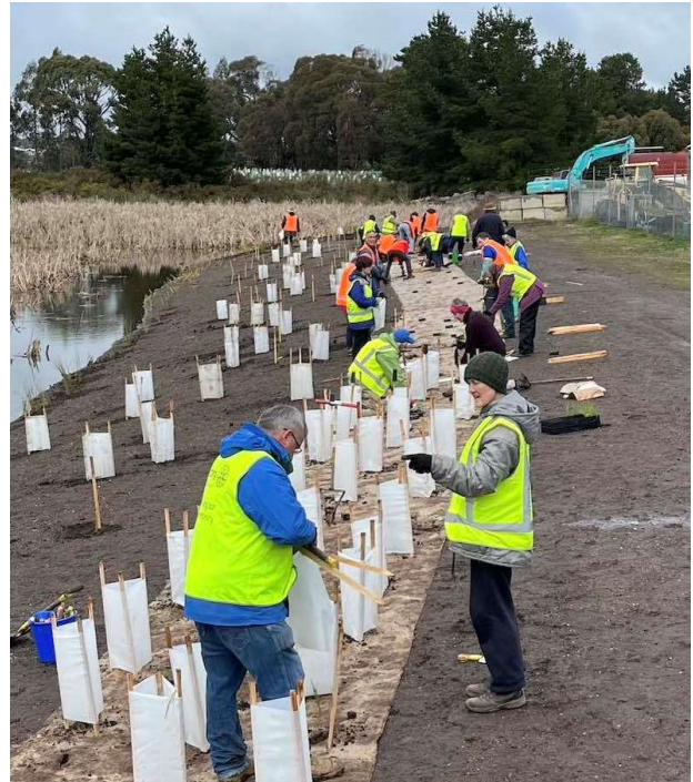
Planters at Soapy's Dam. Image 31st August 2025