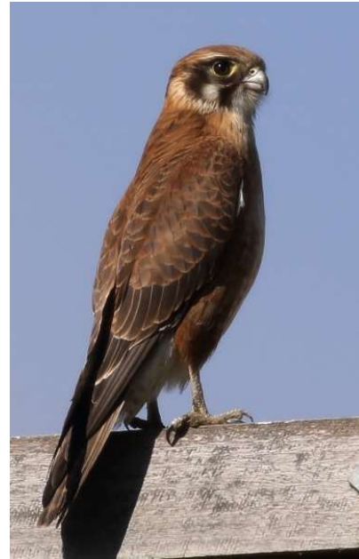
Adult Brown Falcon.

Any time a species is encountered at a site for the first time (let alone after 145 eBird checklists at Union Jack Reserve, Buninyong), that is cause for excitement — always rewarding to increase a site's species tally! Without further ado, behold the species behind the site-first encounter, Bird of the Month's first falcon, the Brown Falcon!