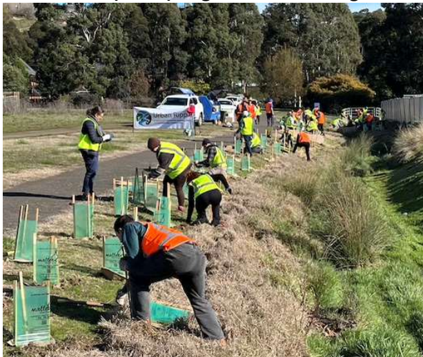
61 Friends planted 500 trees and mostly shrubs and grasses along Lal Lal Drain. Image 3rd August 2025.