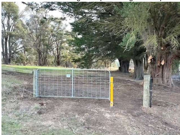
New gate and access. A clear pathway. Image: 9 th July 2025