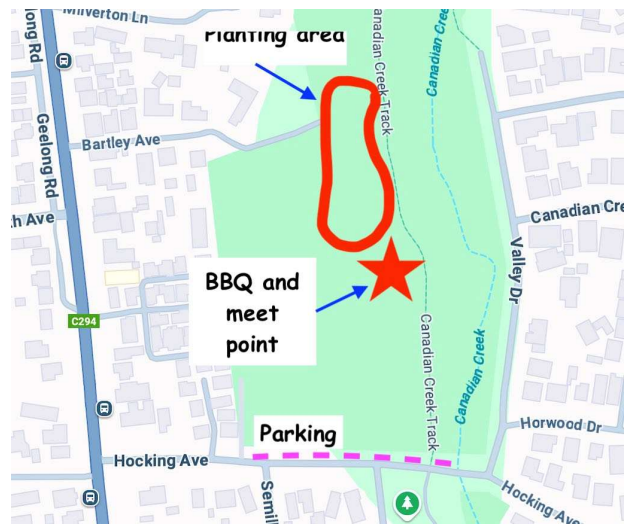
Canadian Creek planting map.

750 trees shrubs and grasses to be planted at Canadian Creek, Mt Clear, 10am to 12noon, Sunday August 10 th 2025. The wonderful Rotary Club of Ballarat West are providing support and the sausage sizzle. Signs from Geelong Rd. Bookings: https://www.trybooking.com/DEFGQ