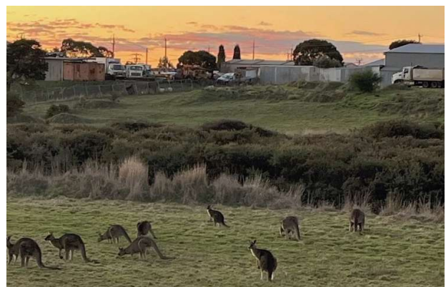
Kangaroos are a regular sight on Soapys Creek behind the Elsworth St Industrial Estate in Mt Clear at dusk 1 st July 2025.

Kangaroo sightings are quite common along the Canadian Creek, Corridor and in the Woowookarung RP.