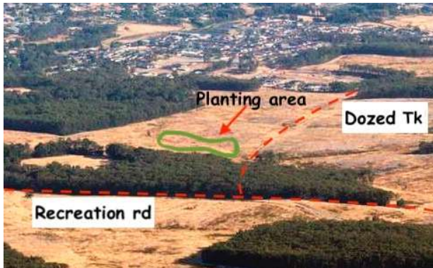
The cleared blue gum plantation land. Image: looking north toward the city from above Green Hill, 28 th February 2014.

In 2012 the failing blue gum plantation in the Canadian Forest was removed by the lessee, the ground cleared and handed back to the Government absolutely bare as shown below.