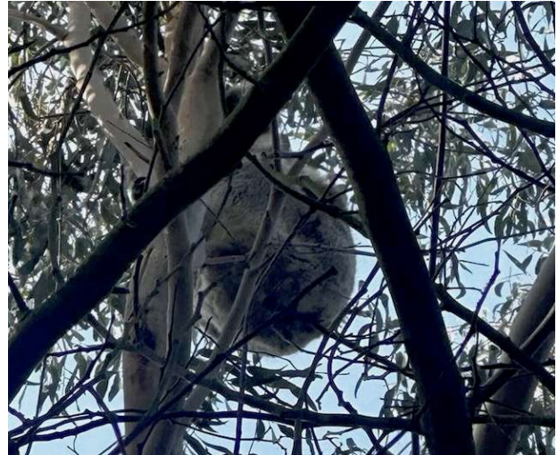
Koala at Scotchman's Lead. 20 th July 2025.