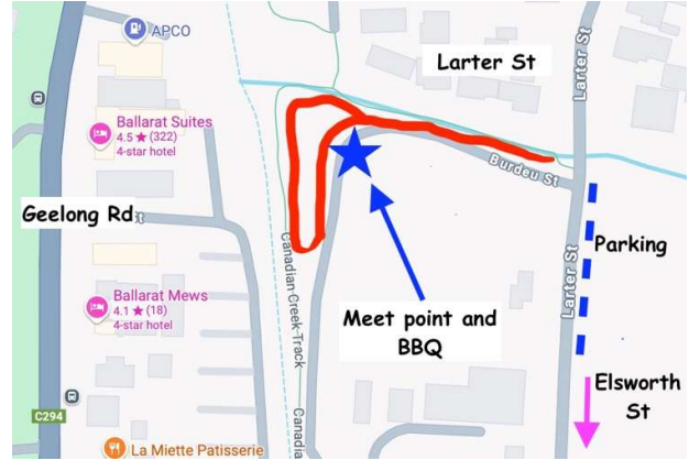
Lal Lal Drain map

wonderful Rotary Club of Ballarat are providing support and the sausage sizzle. Signs from Lal Lal St and Elsworth St. Bookings: https://www.trybooking.com/DDVMC