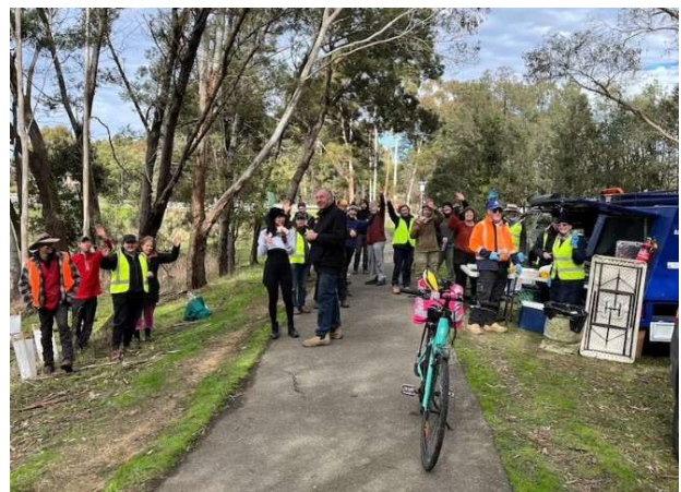
Dozed Track (Site2), Woowookarung RP July 27 th .