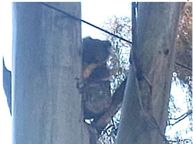
This little Koala was spotted beside Geelong Rd. A quite precarious place to be. Wildlife rescuers were in attendance on 22 nd July 2025.

October to March is Koala breeding season and peak sightings time. If you see, hear or find scat from a Koala, please send the information containing the when, where, and how to: focinfo@gmail.com . Images are gold (even if a little blurry).