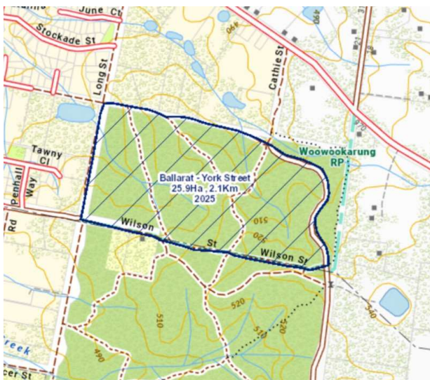
Planned burn map courtesy Forest Fire Management.