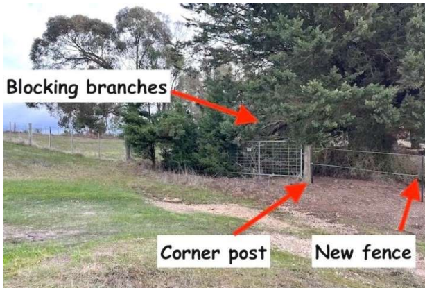
The blocked gate request. Image: 7 th July 2025.

the fallen timber was removed, the trees trimmed and a new gate with pedestrian and cyclist access installed.