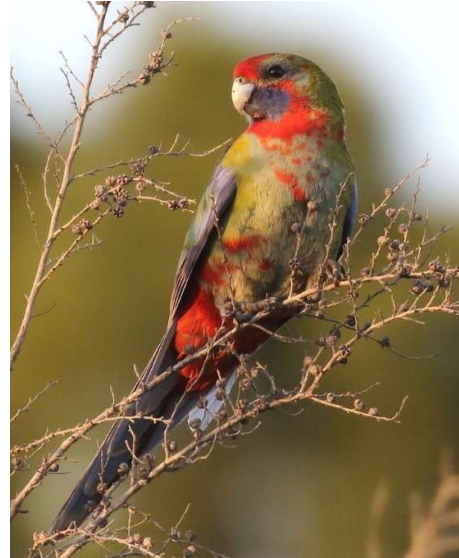
Juvenile Crimson Rosella. Judging by the patchy red, this individual is partway between juvenile and immature.

lerp), and wasp galls. Crimson Rosellas naturally nest in tree hollows, but have adapted to nesting in building cavities.