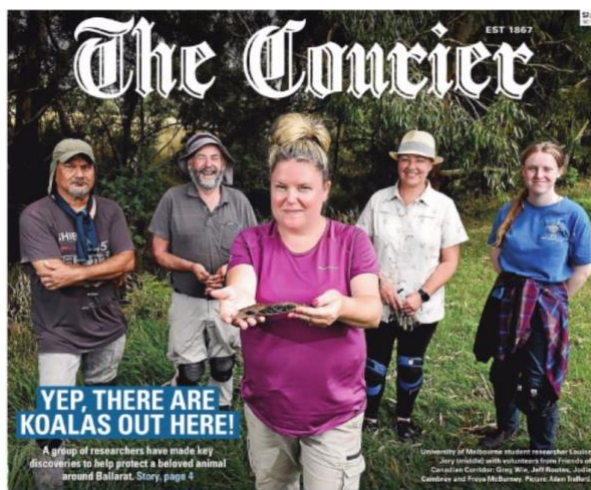
Ballarat Courier 28 th January 2022

The Bunny Trail: The completion of the Bunny Trail from Recreation Road to the Park is now complete.