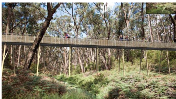
The proposed bridge as proposed in the Strategic Directions Plan.

The trail may form part of the Regional Goldfields Track between Bendigo, Ballarat and Buninyong.