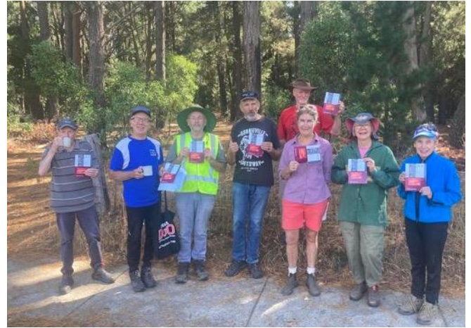
FoCC volunteers with “Community Gold” card. Image: March 18 th 2023

Volunteers at the recent FoCC Working Bee at the 55 Recreation Rd, removed pine saplings and cleared the path of the new track all received “Community Gold” cards. We thank Buninyong Community Bank (BCB) for their support of this project. As part of the project BCB donated $250 of vouchers for project supporters. Volunteers at the 55 Rec Rd project showing their Community Bank of Buninyong “Community Gold” cards.