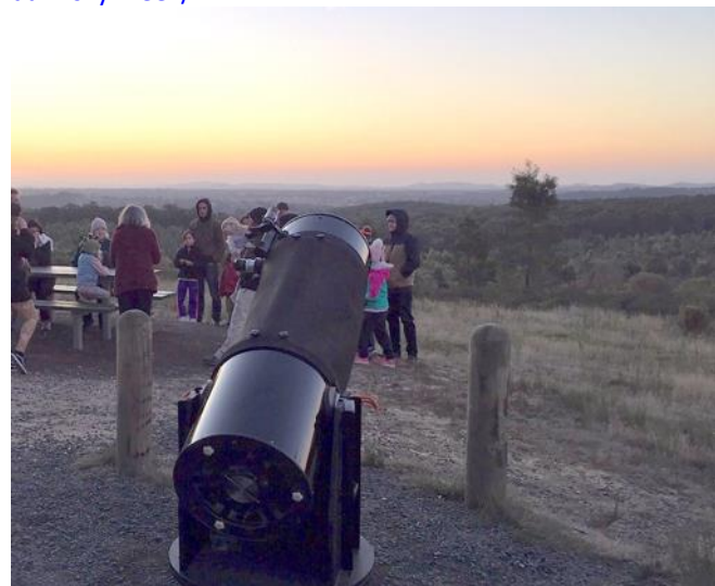
The telescope on dusk last year: April 22 nd 2022.

https://ballaratorbservatory.org.au/event/international-dark-sky-week/