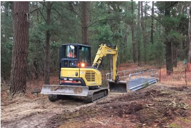
Earth works on the trail Friday March 31 st 2023

Drainage and trail topping works at the north end of the trail will happen in the next few weeks. Once completed the trail will be open for use.