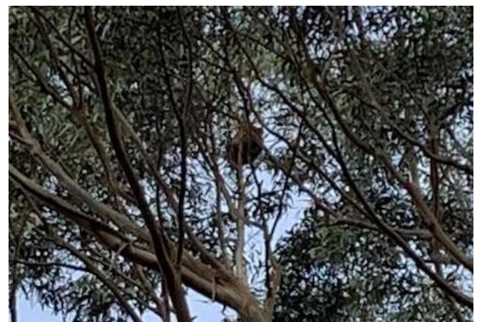
Koala on Recreation Rd. March 25 th 2023