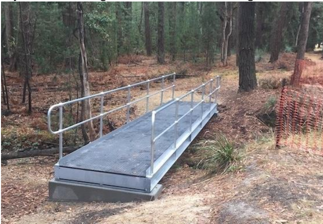
Installed bridge at 55 Recreation Rd. Image March 24 th 2023

The “Bunny Trail” bridge was installed on Thursday March 23 rd . The bridge is funded by the Community Bank Buninyong, Community Investment Program. Lloyds Engineering of Wendouree built the bridge and installed it adjacent to the original 1889 wooden rail bridge.