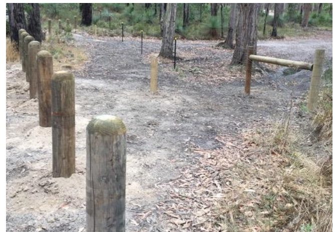
Bollards and fence at Red Hill on Boundary Rd. Image March 26 th 2023

Around 250 bollards are being placed to keep vehicles out but to allow shared access for others.