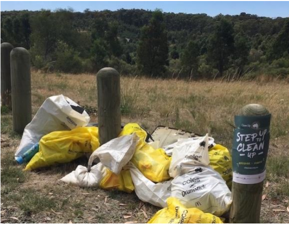
The final collection, Sunday March 5 th 2023