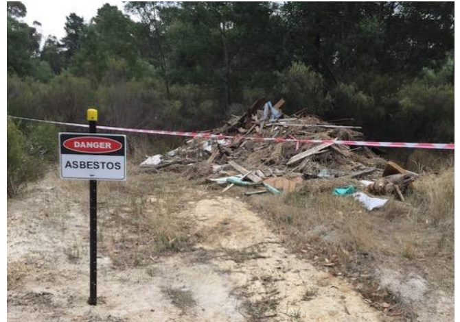
Asbestos laden dump on Boak Rd Mt Clear. Image 26 th March 2023

white weather boards and downpipes, please contact Parks Victoria or the City of Ballarat or the FoCC.