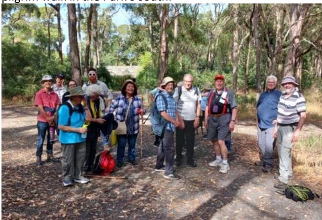
Pilgrim walkers near Hendersons Lane Mt Helen.

The Buninyong Uniting Church and the FoCC hosted a short pilgrim walk in the Park’s south.