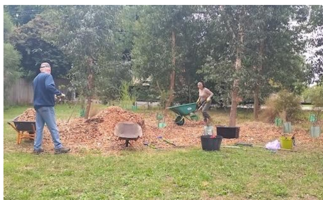
Mulch spreaders at work. Image: Courtesy of Specimen Vale Group March 2023

Friends of the Yarrowee River is currently running small local group activities.