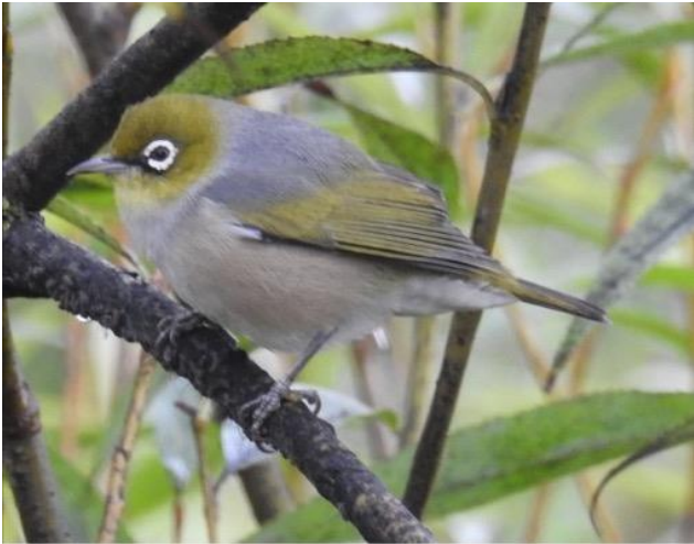
Above: adult Silvereeye, and below: all adult Silvereyes.