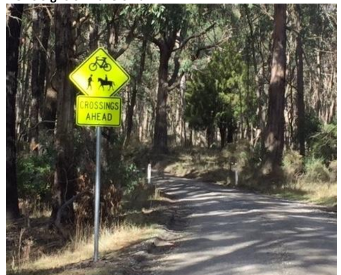
New signs. May 22 nd 2022

The City of Ballarat have installed two new 'Cyclist, Walker and Horse' warning signs on Bakers Rd in Woookarung Regional Park. Bakers Rd is regularly used by cyclists, walkers and horse riders and the new signs are a welcome step.