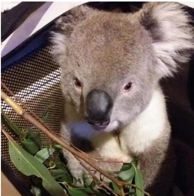
Young injured male in care June 5 th 2022.

Koala observation map courtesy of Emma, June 4 2022. Not so lucky was this young male rescued by local wildlife rescuers after a vehicle strike on Yankee Flat Rd on June 2 nd . Unfortunately he did not survive the trauma. He was the 19 th Koala rescued in the Ballarat region as a result of a vehicle strike since Jan 2021.