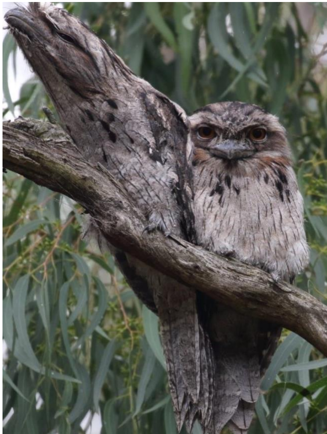
Adult Tawny Frogmouth

Tawny Frogmouths are resident (i.e. non-migratory, present year-round) inhabitants of open woodland and forests, wooded watercourses, gardens, golf courses, and streetscapes (particularly during night activity). Size varies widely (33-52cm), with males being larger. Breeding season is August to December, with two eggs laid per clutch. Both sexes share incubation duties of eggs.