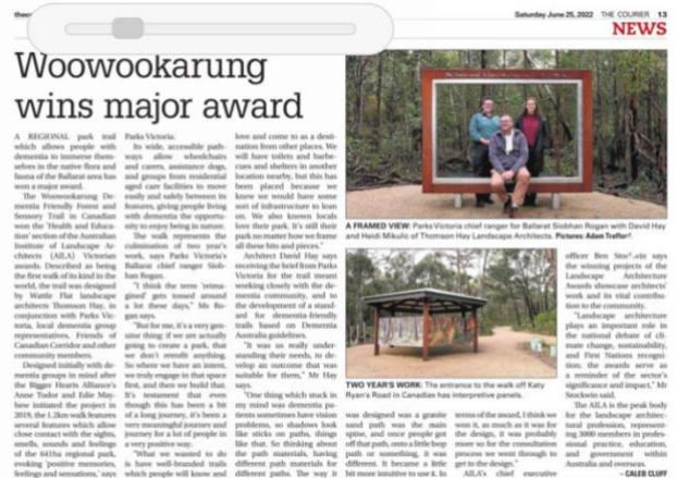
Page 13 Ballarat Courier Saturday June 25 th 2022

Education Landscape" accolade for the engagement and design work undertaken with the Ballarat community to realise the wonderful Dementia Friendly Forest and Sensory Trail within Woookarung Regional Park.