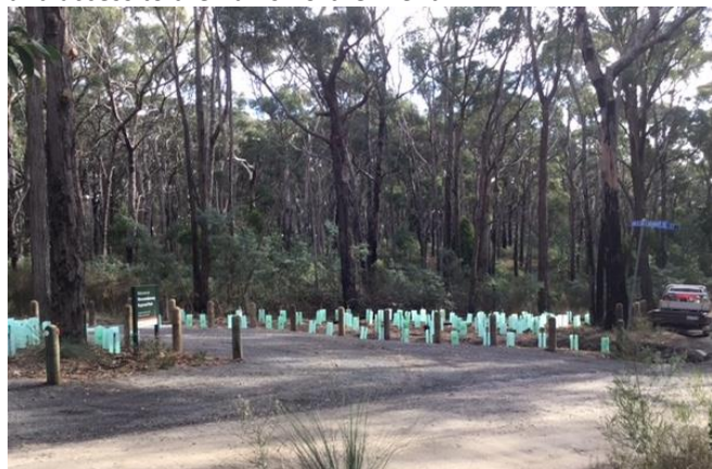
Cathie St car park tree plantings. Image June 3 2022, courtesy of Blake.

Parks Vic have constructed a Car Park at the intersection of Cathie St and York St. The car park provides safe parking and access to the Parks northern end.