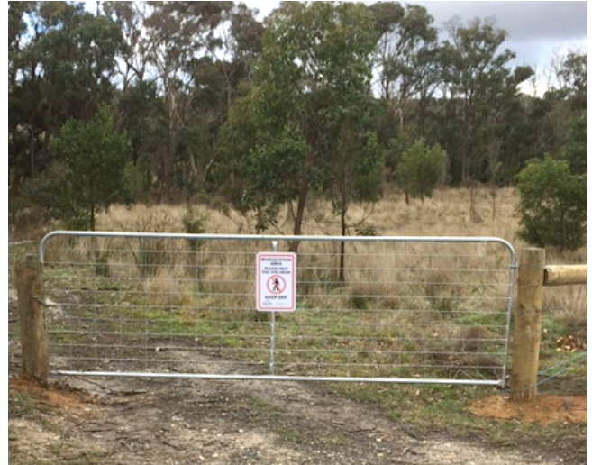
Gate with new sign June 26 th 2020

Parks Victoria have posted revegetation signs along the new fence along Katy Ryans Rd. The area behind the fence was a heavily gorse infested area. The 1976 Eureka Orienteers map shows the area as "thick gorse". The gorse was treated with the "Eco Blade" gorse removal machine in 2018.