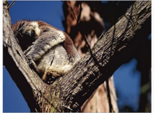
LOCAL RESIDENT: This image of a koala was captured in Mount Helen last month, proof that the municipality is still very much a part of the area's landscape.