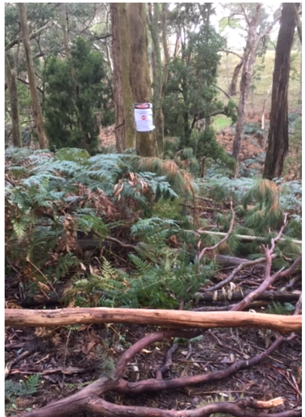
Track closure sign and cover. Image June 26 th 2020

An illegal track near Recreation Rd where 48 grasstrees were damaged by vandals in May was closed by Parks Vic in late June.