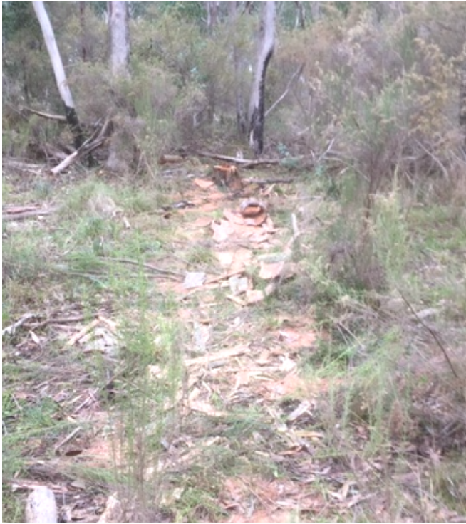
Fallen stolen tree remains. June 6 th 2020

Rubbish dumpers. FoCC encourages Park friends to report illegal track builders, rubbish dumpers and wood thieves to Parks Victoria on 13 1963 or e: info@parks.vic.gov.au Please note the offender's registration number if applicable, location and details.