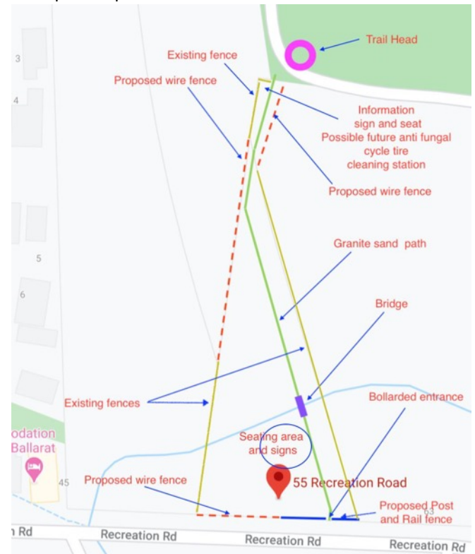
Planned works at 55 Recreation Road.

FoCC has made application to the Bendigo Bank community fund to enable the trail to be constructed on 55 Recreation Rd as per the plan below.