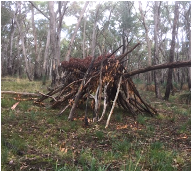
Also spotted near the Wilson St Watertanks.

Spotted in the north of the Park, something that every kid near bushland has achieved at some time or other.