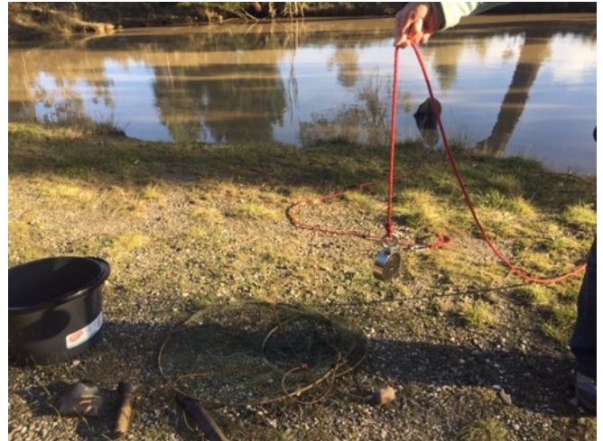
Thanks, Tayla: Image: June 12 courtesy of Rob

The Park continues to amaze with new recreational activities. Spotted near magnet dam on Katy Ryans Rd was 'magnet fishing". A powerful magnet is used to fish for metal objects with a metal framed yabbie net, several steel belted tires being retrieved. No safes or exotic finds yet!