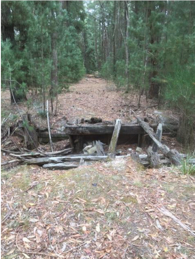
The bunny rail bridge: Image November 2019