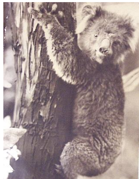
Image date and origins unknown. Courtesy Ballarat Historical Society library.

http://www.ballarathistoricalsociety.com/collection/index.htm