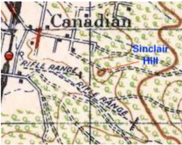
Map of Rifle Range and Sinclair Hill 1936 Ballarat map.