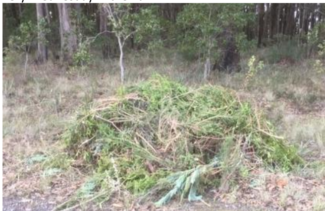
Green waste on Boundary Road

Rubbish dumpers have been out in force with large amounts of green waste and other disgusting rubbish being dumped. Parks Victoria have a contract clean-up service very Wednesday in the Park.