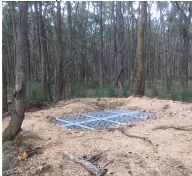
Mine capping on Sinclair Hill April 14 th 2020