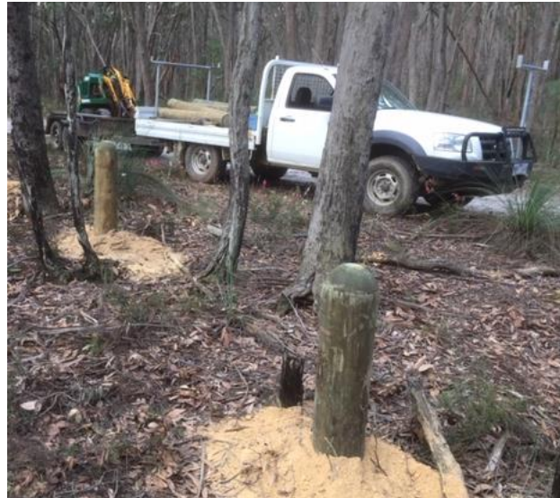
The eastern end bollards being installed May 7 th 2020

The fence has been designed to allow animals to go under or over whilst excluding vehicles. Access is at either end of the fence. At the eastern end of the area bollards have been placed to control vehicle access.