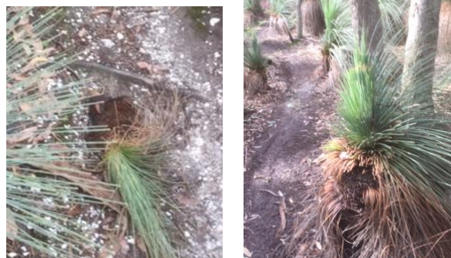
Grasstree damage Recreation Rd. May 27 th 2020

One of the disturbing aspects of the illegal tracks has been the damage to grasstrees on a trail near Recreation Rd Mt Clear where 48 grasstrees were damaged by vandals.