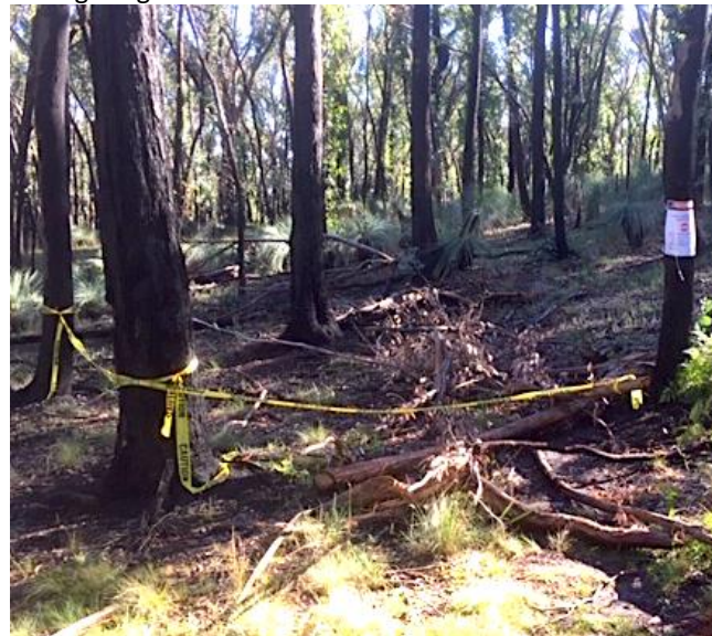
Closed track for the third time May 26 th 2020

A media report at the time, claiming that steel stakes were being placed on trails, has been found by Parks Victoria and the Victoria Police to be wrong. Steel stakes were used by Parks Victoria in the lawful closing of an illegally constructed track. Vandals had destroyed the park works by pulling up the closure works thus exposing the steel stakes. Parks Victoria have since reinstated the closure works, tape and signs again.