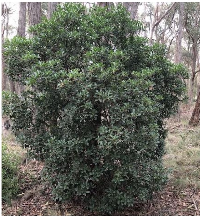
Strawberry tree near Bakers Rd

Recently spotted in the Park in three different locations is a Strawberry Tree, or Irish Strawberry Tree, Arbutus unedo . Locations have been passed to Parks Victoria for eradication. The Park does not need this weed in it. If you see this plant let Parks Victoria p: 13 1963 or e: info@parks.vic.gov.au or FoCC know!