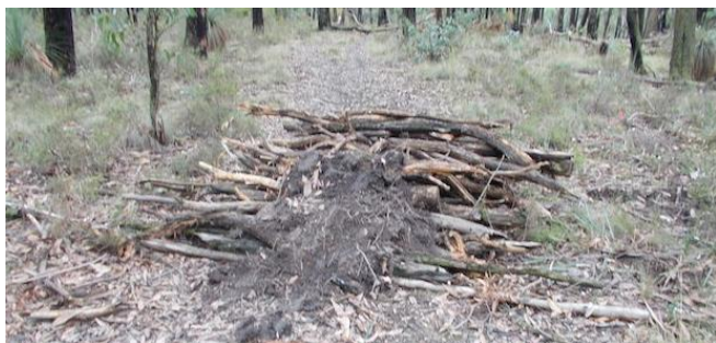
Bakers Rd illegal construction. Now removed by Parks Victoria.

Rubbish dumpers have been out in force with large amounts of green waste and other disgusting rubbish being dumped. Parks Victoria have a contract clean-up service very Wednesday in the Park.