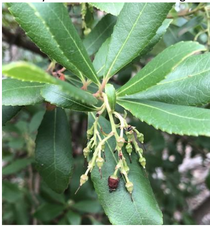
Leaves and seeds