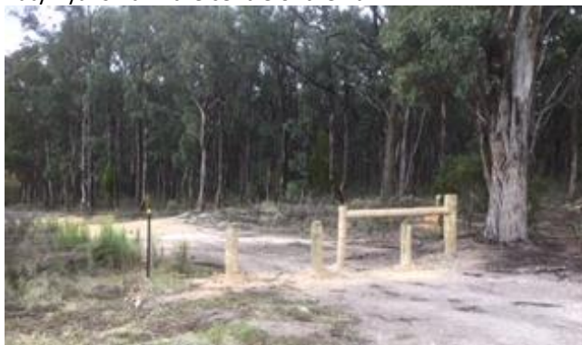
East end of fence and closed vehicle track. May 24 th 2020

Parks Victoria have installed a fence along the north side of Katy Ryans Rd in the centre of the Park.