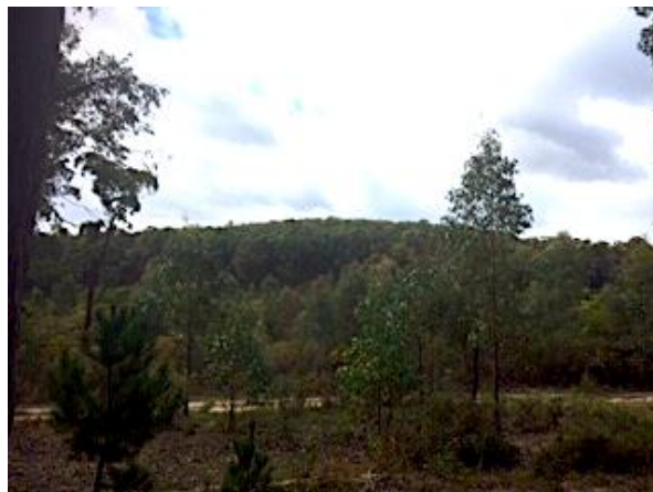
Sinclair Hill from the Dementia Trail. Image May 24 th 2020

Recent searching for a mystery eucalyptus distillery turned up previously unknown information about Sinclair Hill and Sinclair Hills Lead.