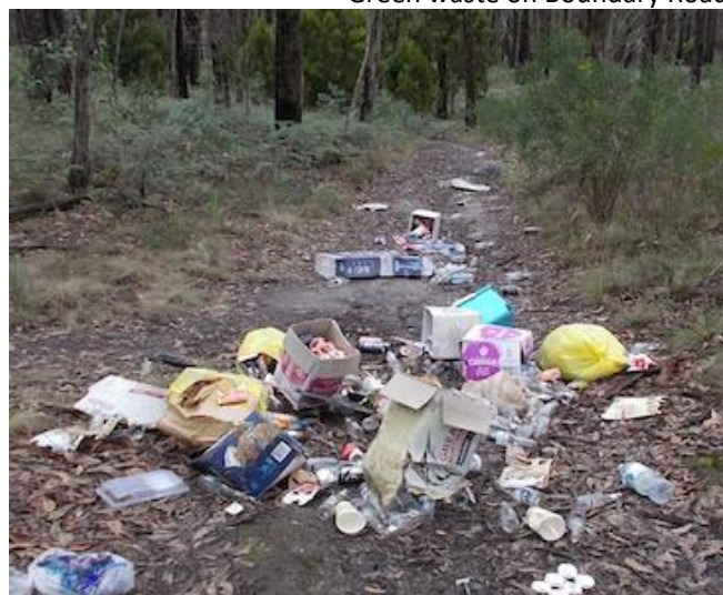
Party rubbish off Wilson St Canadian

Firewood is being cut and stolen regularly from the Park. Fallen trees can be there one week and gone the next with just the tops left. FoCC encourages Park friends to report illegal track builders, rubbish dumpers and wood thieves to Parks Victoria on 13 1963 or e: info@parks.vic.gov.au Please note the offender's registration number if applicable, location and details.