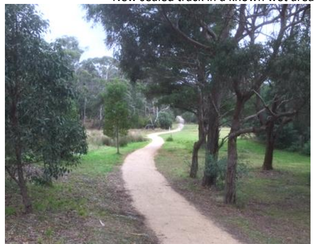
South end of the track along the Canadian Creek