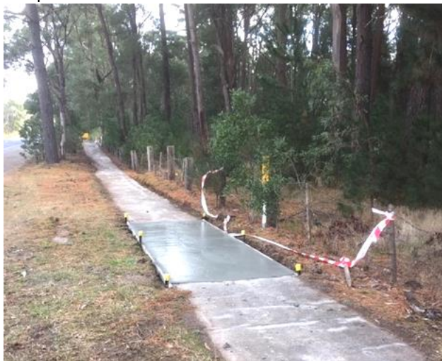
Repaired footpath at 55 Recreation Road

The City Council works team have completed footpath repairs right in front of the "Catching the Bunny" 55 Recreation Road land. Another part of the trail access completed.