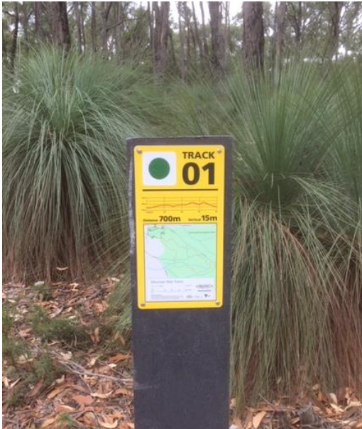
Track marker on the "Crit" track Feb 27 th 2020