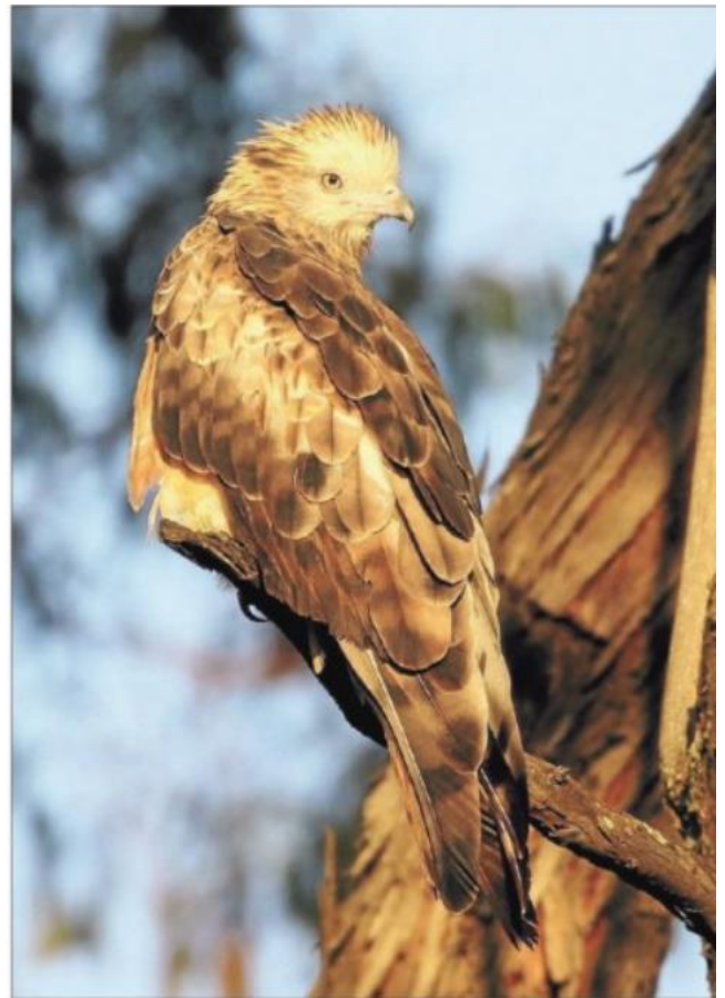
VISITOR: A square-tailed kite at Mount Clear earlier this month.