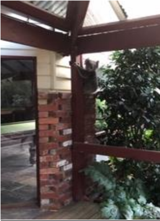
Dec 2019 Eureka St visitor

to be paved with light covered stone so as animals crossing at night may be more easily seen have been put forward.