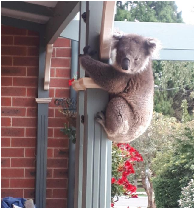
Feb 24 th 2020 Simson St B'Yong: Image courtesy of Liz.