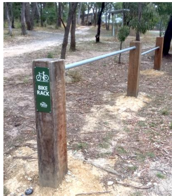
Bicycle hanging rack Feb 27 th 2020