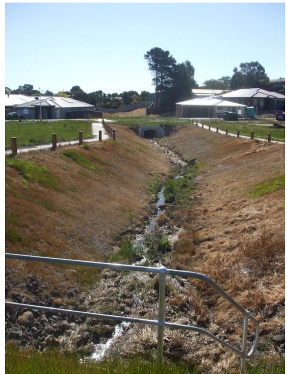
Grasree Creek Nov 2019. How could this creek be restored now!