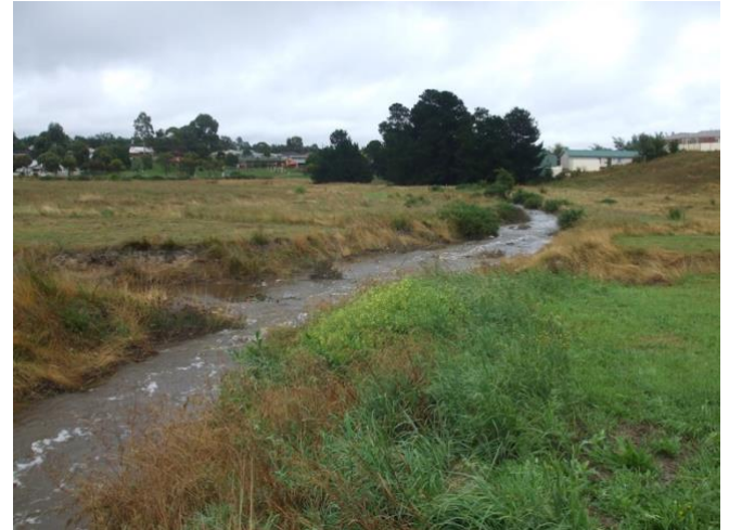
A living very bare Grasree Creek in flood 2011. Restoration was still possible then however the result now is a mess as shown below.

"Little creeks do matter, the eleven creeks of Canadian" was the focus of the second presentation. Eleven creeks run from the top of the Canadian Ridge on the East side of Ballarat into the Yarrowee River. Every creek is degraded in some way from the goldfield's activities. In more recent times developers have been able to pipe creeks thus destroying the creeks ecology and the living corridors which run along creeks.