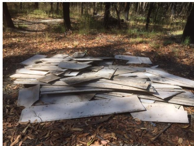
Parks cleaned this mess up very quickly. Well done!

Recreation Road and Olympic Avenue please call the City of Ballarat on 5320 5500