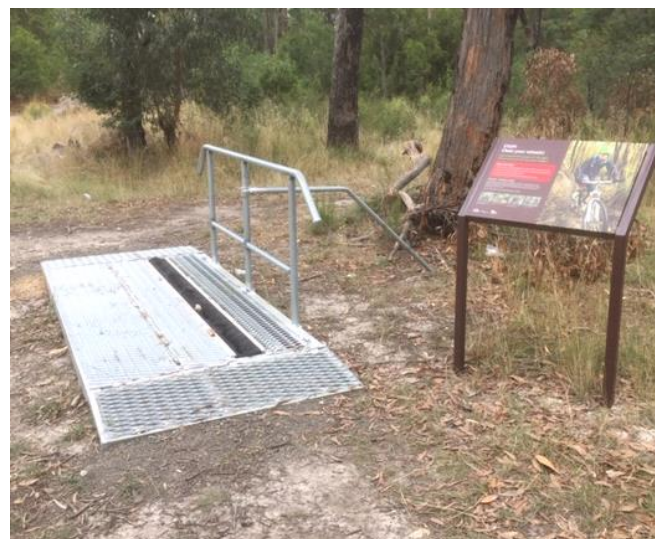
Bicycle wheel cleaning station Feb 27 th 2020

The Mountain Bike Trail Head at Mt Clear was constructed by Parks Victoria in conjunction with the Ballarat Mountain Bike Club. Yet to come is a large information board. Below is the wheel cleaning station to reduce the transmission of Phytophthora via infected dirt on bicycle wheels. Just wheel it through.