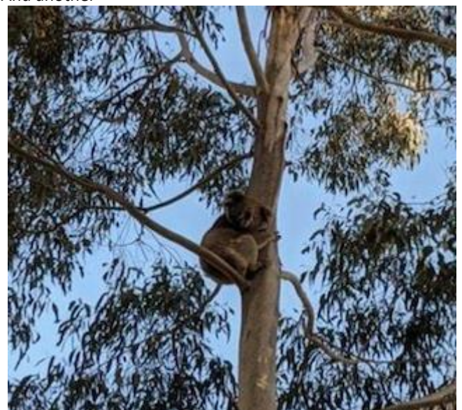
Koala Woodlands Drive Mt Helen. 27 th August 2020.