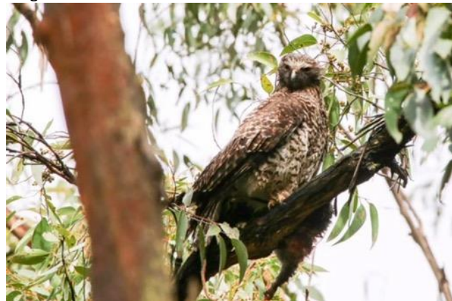
Powerful Owl 24 th August 2020.

Spotted in a back yard with a possum for breakfast. A magnificent bird.