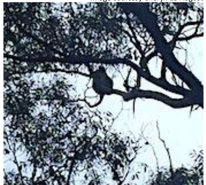
Union Jack Reserve 16 August 2020 And another