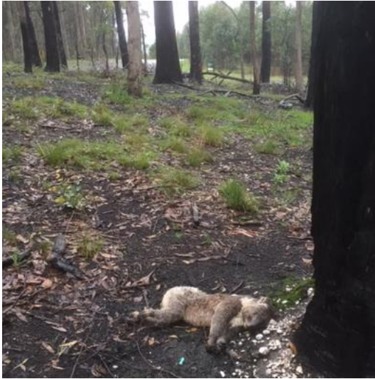
Cnr Boundary Rd and Foss Lane August 16 th 2020

A wonderful ranger from DELWP wildlife division came to assistance and the Koala is now in cold storage waiting for the COVID regulations to change, to then allow the Koala to be autopsied. Parks and FoCC want to know why the death occurred.