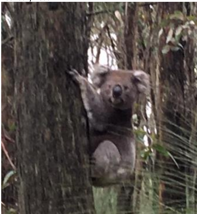
Koala on the north side of the Gorge. 13 August 2020

Koalas this month have been spotted at Mt Buninyong, the Gorge, Union Jack Reserve, Mt Helen and a sad finding at Boundary Road.