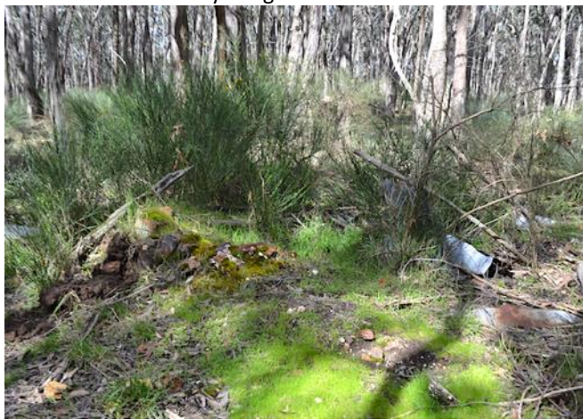
Remnants of the hut. Image 26 th August 2020

The Park has very few built remains from the Goldfields era. The Cremorne Rifle Range still has firing points and butts. There are extensive water races through the Park, several goldfields dams, alluvial diggings, mineshafts and old roads remaining. The site of the old Greenhill School north of Greenhill Rd is still evident. There is the quarry masters house (circa 1865) located outside the Park near the Gorge. The remains of a simple hut were recently found on the north side of Sinclair Hill between Richards St and Clayton St east. The base of the mudstone chimney, tin roof and walls are still evident. The hut existed in 1934 according to the 1934 Aerial Survey images.