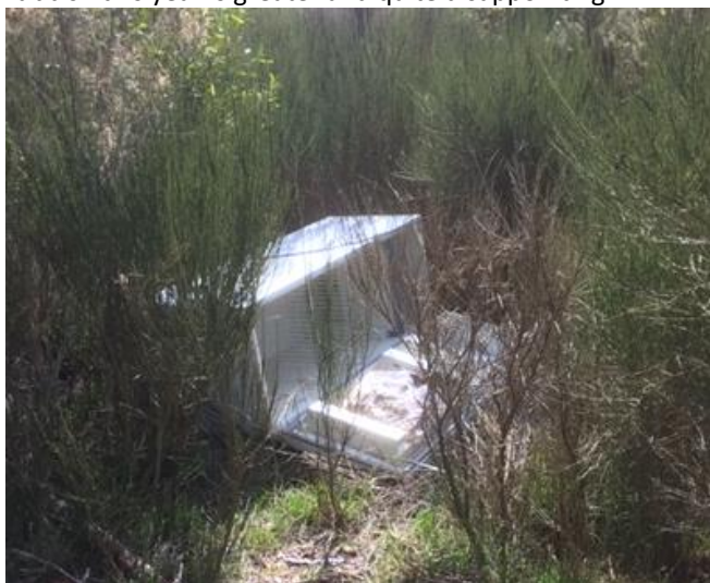
Dumped Fridge at Boundary Rd. Image: August 27 th 2020

Every Wednesday, Parks Victoria has a contractor picking up rubbish dumped in the Park. Anecdotally the amount of rubbish this year is greater and quite disappointing.