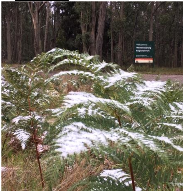
Snow on Boundary Rd 4 th August 2020.