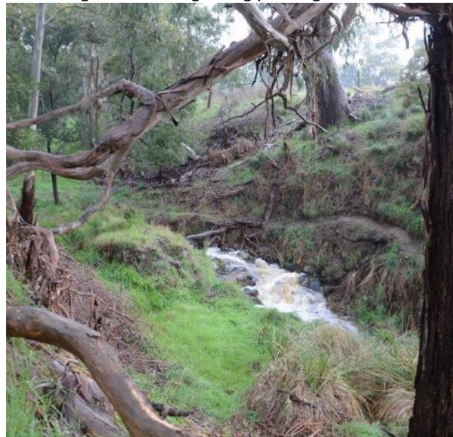
The cascades on the Unamed Forest Tributary in the Gorge 23 rd August 2020.

With the good rainfall over the previous days the cascades in the Gorge were flowing strongly on August 23 rd .