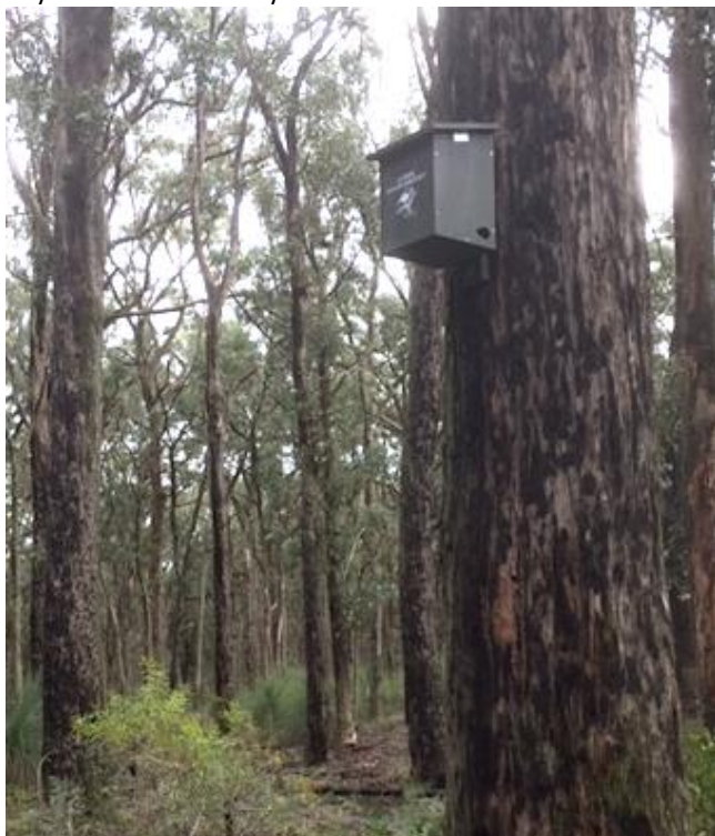
Box. Image August 20 2020

There are also a number of boxes located in that area. Does anyone know the story of the boxes?