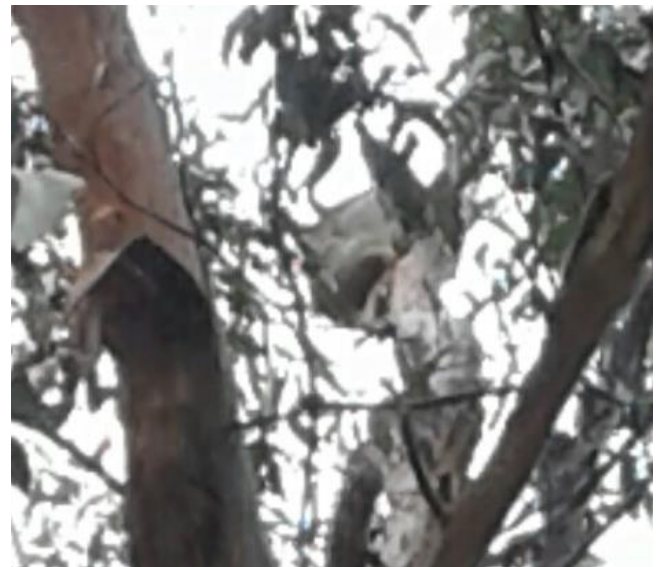
A hard to see little Koala on Blackberry Lane. Mt Buninyong 23 August