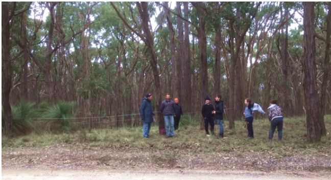
South Gate activities. July 18 th 2020

Scouts Spotted in the middle of a hike and planned activities were a group of scouts and leaders.