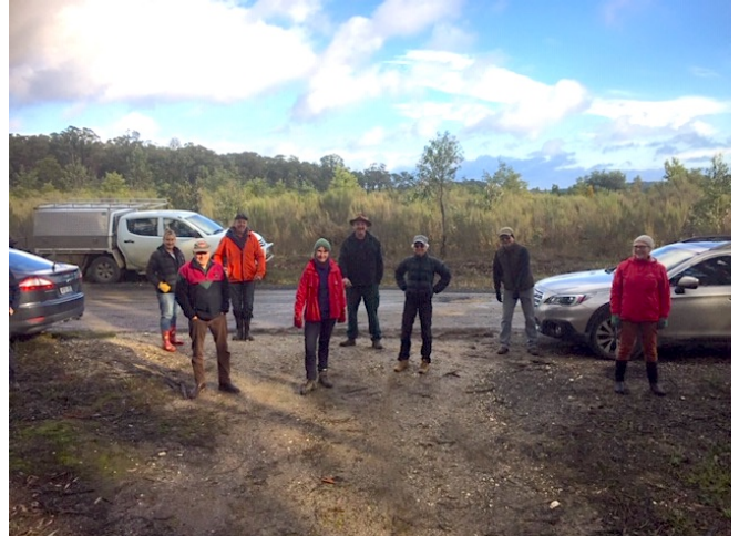
The ten volunteers all socially distancing July 12 th 2020

A small group of intrepid and socially distanced FoCC members recycled 1535 tree guard Stake and 500 tree guards for reuse in the proposed August tree planting.