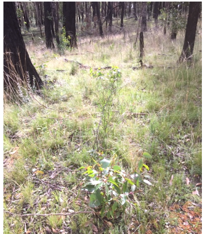
Regrowth just north of Clay Road. July 11 th 2020

Regrowth in the 2019 planned burn area has been spectacular with sundews, grasses, shrubs and eucalypts shooting strongly.