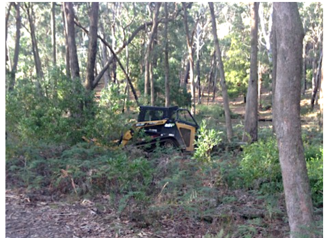
Front slasher at work. July 2 nd 2020