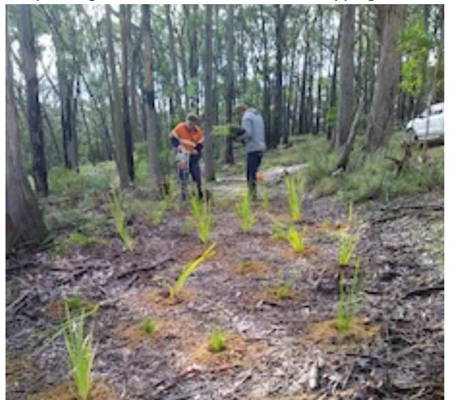
CCMA contractors at work July 22 nd 2020

The Corangamite Catchment Management Authority CCMA and Parks Victoria collaborated to plant 500 grasses and rushes on a steep old track on the south side of the gorge. The plantings will stabilise the bare track stopping erosion.