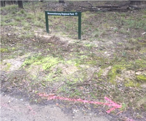
Pink arrow showing the path. July 2020

Runners etc in the Park. Running routes keep showing up with tin markers, white arrows and other times pink arrows or ribbons on trees all indicating the route.