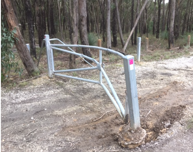
Vandals destroyed the South Gate July 12 th 2020

Vandals drove a stolen 4WD through both the North and South Gates over the weekend of July 11 th and 12 th . During the following week the gates were replaced by Parks.