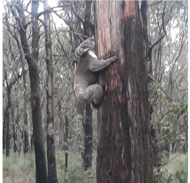
3pm July 6 2020

And at Durham Lead a mum and joey. See the video record on the FoCC facebook.