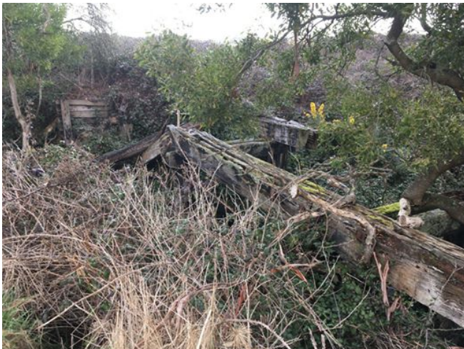
Bunny rail bridge across the "Unnamed Forest Creek"

Alas, a few hundred metres south of the old Mt Clear Railway Station (Earth Ed Science Centre) are the much larger remnants of another wooden Bunny rail bridge. This bridge is in private hands and public access does not exist.