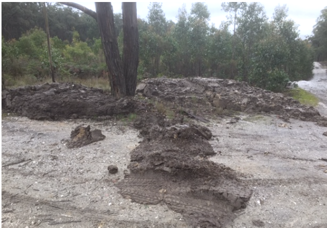
Dirt dump at Katy Ryans Rd July 20 th 2020

Tip truck dirt dumpers have dumped metres of excavated fill into the Park on the south side of Katy Ryans Rd. Other dumps are at Recreation Road and Olympic Avenue.