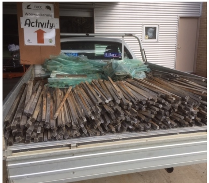
A ute load of 800 stakes and 275 guards. July 12 th 2020