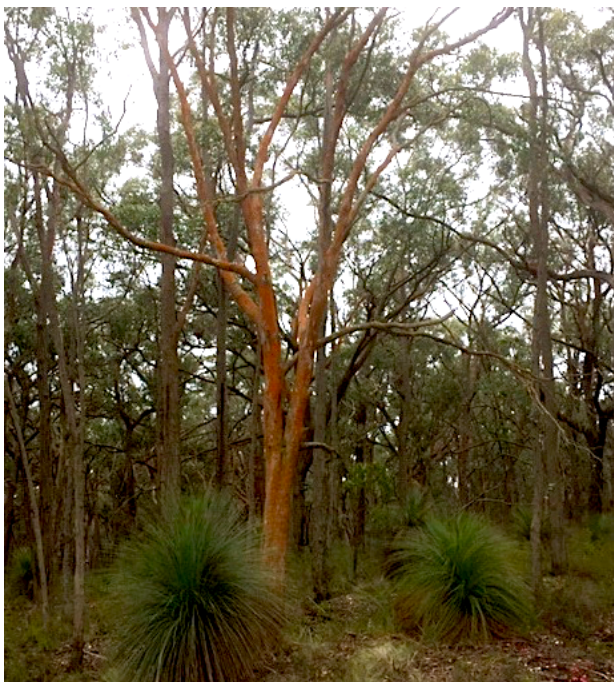
July 9 th 2020

11. Colours of the Park. This tree is on the north side of Katy Ryans Rd and has the most marvellous red tinge to its bark.