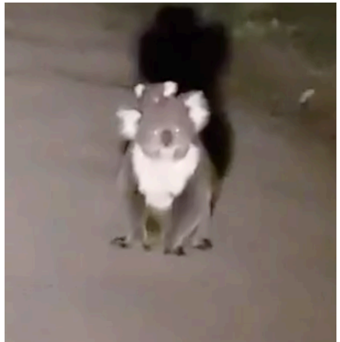
Monday July 20 th 2020

And at Durham Lead a mum and joey. See the video record on the FoCC facebook.