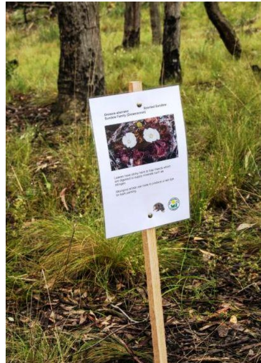
Pop up wildflower ID

The trail will be open for one week beginning on Sunday October 20 th and closing in Sunday 27 th .