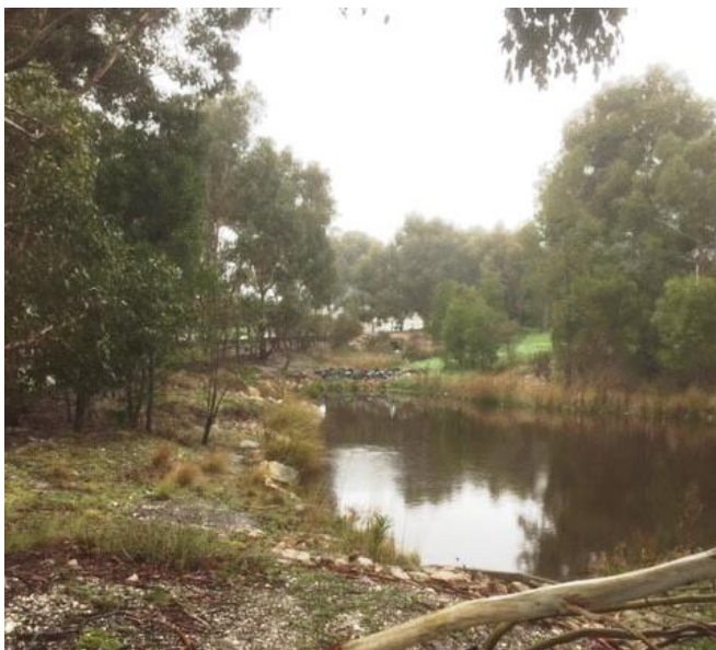
July 2019 Sailors Gully Creek

Imagine what a one in ten year flood could do at this site. If anyone wants to look at good creek developments then go to Pennyweight Gully between Kline St and Richards St or Sailors Gully. Both of these creeks have been constructed with good biodiversity outcomes in mind.