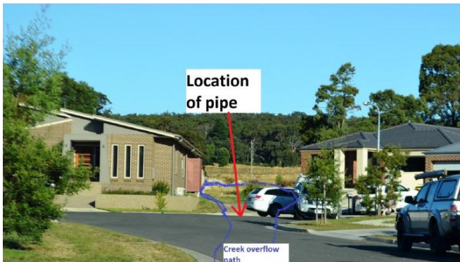
Grasstree Creek Cherry Court Jan 2018

The proposal involved putting a section of Specimen Vale Creek in a pipe and building a road over the top of it. FoCC and local residents opposed this outright and it looks like common sense has prevailed. There are far too many creeks in Ballarat ruined in by being put in pipes. The worst case is at the end of Cherry Court off Richards St. There is where Grasstree Creek runs between two houses in a pipe and under the road as shown on the image below.