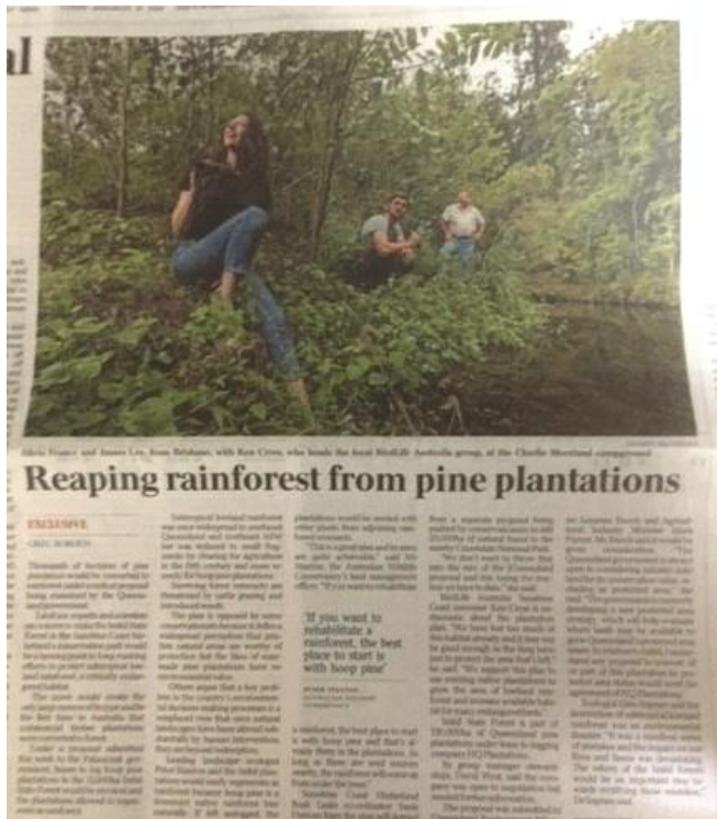
The Australian Page 7 August 17 th 2019.

FoCC would like to point out that the returning of ex plantation land to forest has been going on in the Woowookarung Regional Park now for the last six years.