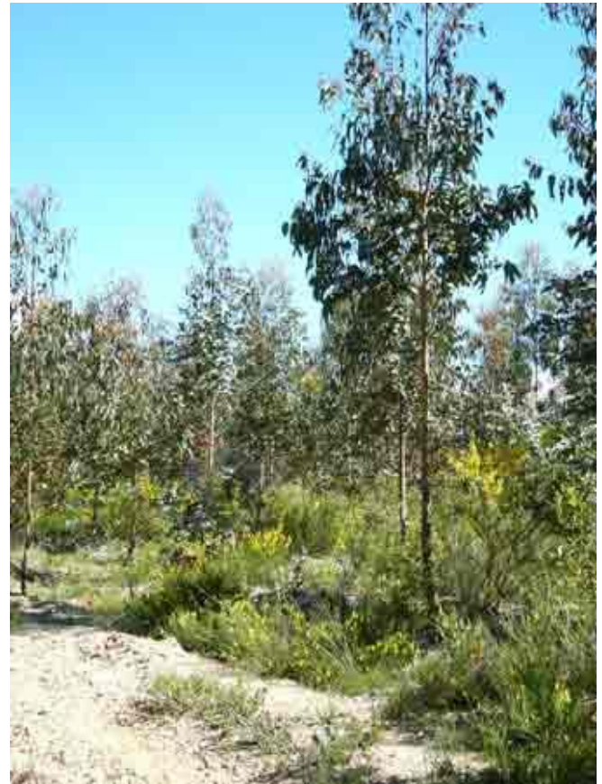
Image: 2005 blue gums growing

plantations were planted, harvested and removed are very rare. Apart from a 2005 image showing blue gums growing and a 2012 images showing the bare ground after the blue gums were removed FoCC has no other images from that time.