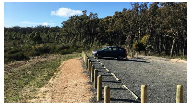
The new car park has also opened

"On a clear day you can see all the way to Mount Langi Ghiran near Ararat, while at night it's a fantastic spot for stargazing."