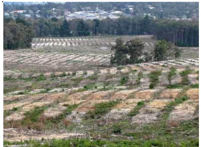
Image: 2012 After the blue gums were removed but before the final ground mulching.

If anyone has images or stories that add detail to the forest and plantation story please contact FoCC at email focinfo@gmail.com .