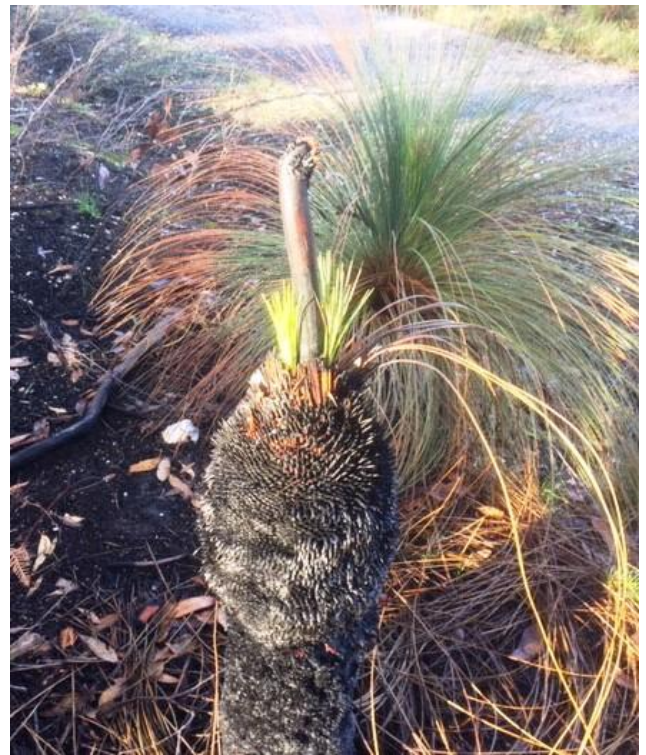
Grasstree regrowth adjacent to Clayton St