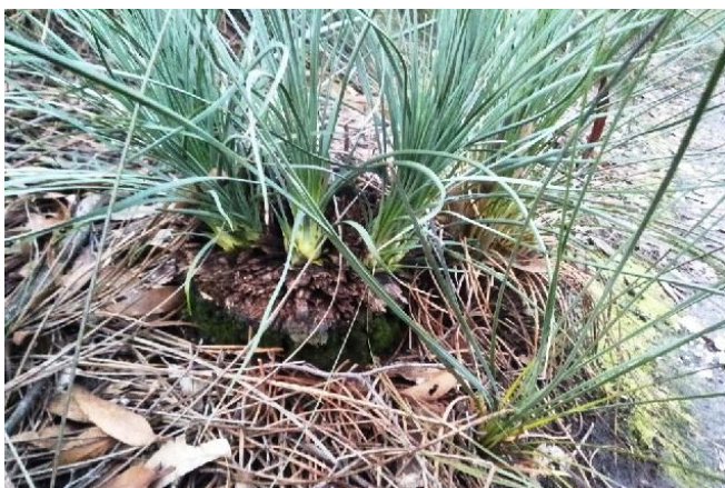
A five headed grasstree reshooting.

Grasstrees are one of the Parks major features. Whilst the threat of phytophthora is very real to the grass trees, fire seems to bring out the recovery phase quite quickly. The planned burn in autumn is already creating new growth.