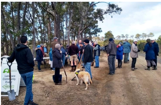
Registering at the planting morning session Image Tarn

Finally to good old nature for bringing welcome rain last Tuesday (July23rd) to settle the trees in. The FoCC will leave the number signs in place for quite a while so you can identify your sector