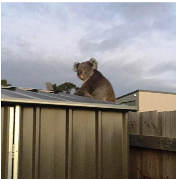
This koala puts new meaning to a Koala on a Buninyong hot tin roof (apologies to Tennessee Williams)