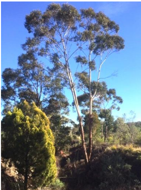
Lal Lal Drain Swamp Gums

there is a little forest of swamp gum saplings being established over an area of about a couple of house blocks. The area was part of the old blue gum plantation and the land was ripped and rotary hoed to a depth of 600mm in 2012 as part of the plantation lease hand back requirements. Whilst the earthworks destroyed all the existing vegetation at that time, a new seedbed was created and the swamp gums have seeded and established well.