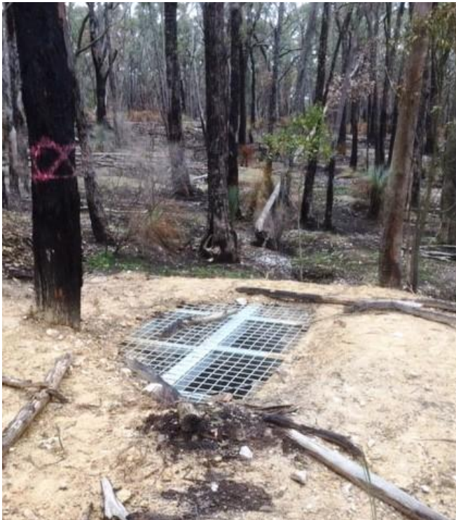
Mine grating South of Pax Hill