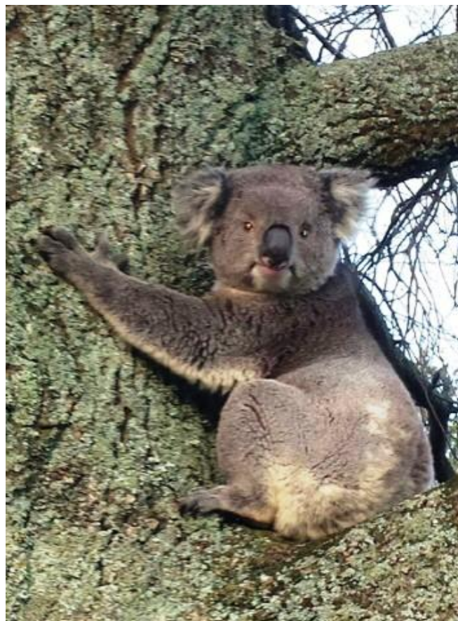
Central Buninyong Koala again