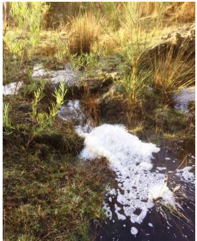
Minor water flow adjacent to the North South track