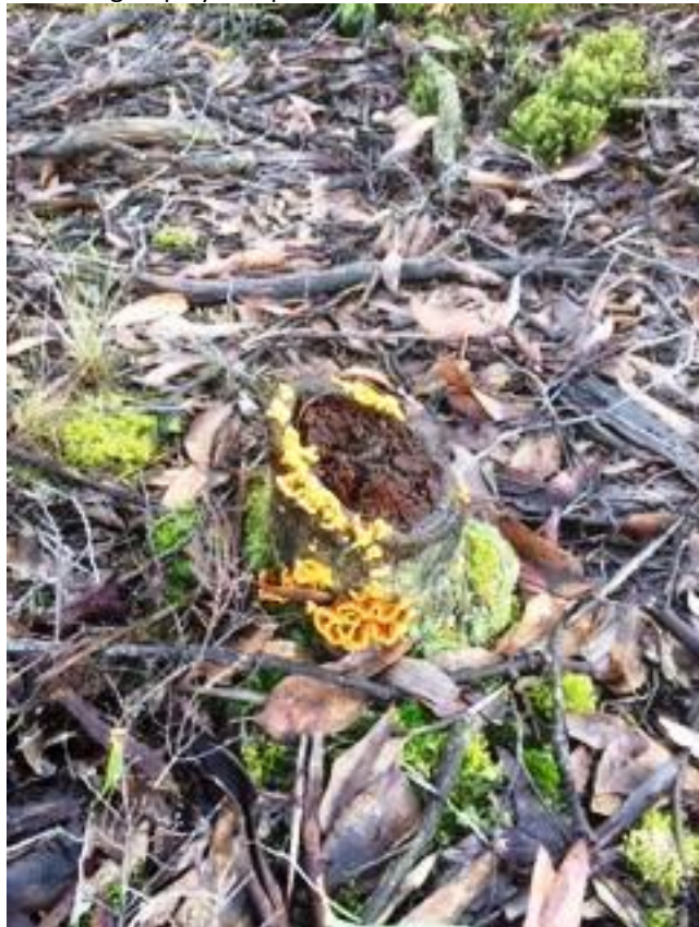
Near North South Track

Autumn in the park was very dry and the fungi have been quite late and limited. However there are some very interesting displays in spots as shown below.