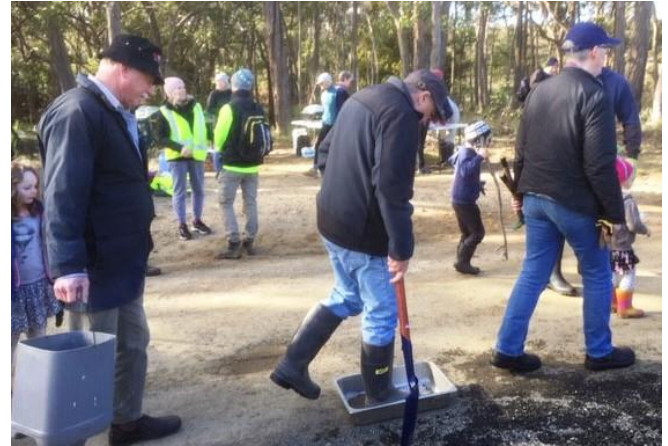
Phytophthora control footwear measures