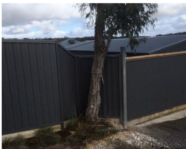
Spotted nearby was a neighbour's very clever approach to protecting a tree. 19 June 2019. Well done!