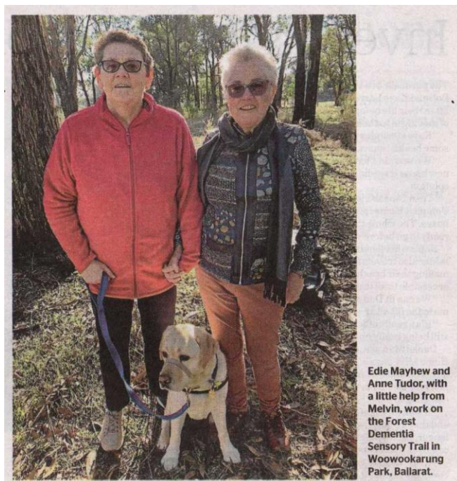
Sunday Age June 16 th

And the Sunday Age joined the story a couple of days later.