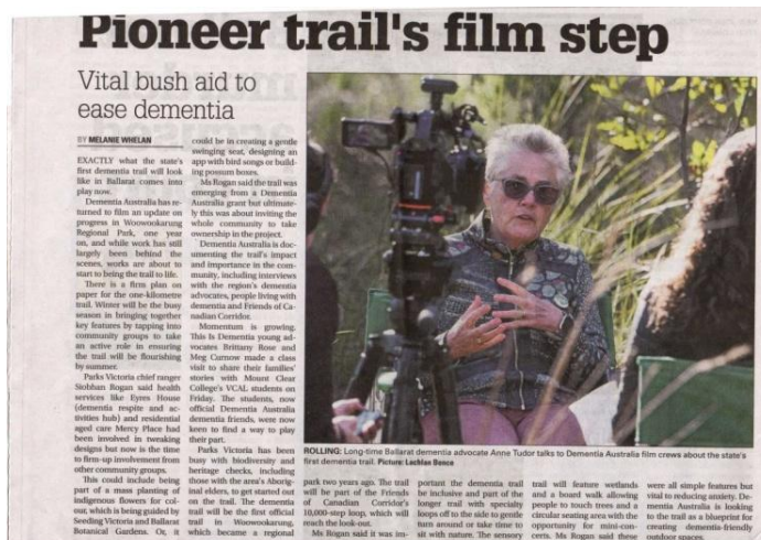
Ballarat Courier June 14 th

businesses have gained Dementia Friendly recognition and in the near future FoCC will make the opportunity available