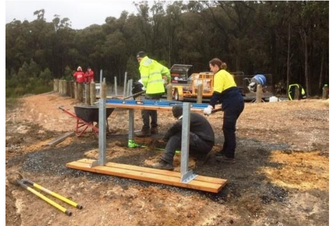
Table installation 5 June 2019

Works at the lookout involved the construction of the picnic tables. This is the first visitor friendly infrastructure in the Park.