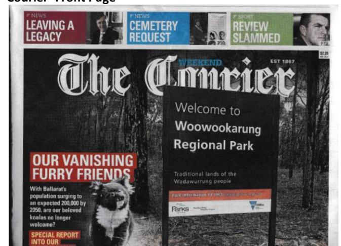
The Couriers Front page Saturday June 15 th 2019