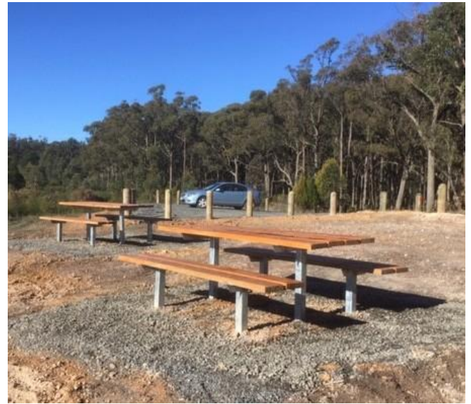
The completed task 7 June 2019