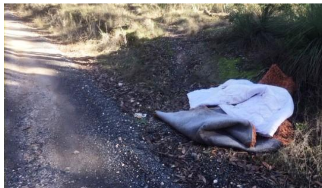
Boundary Rd 11 June 2019