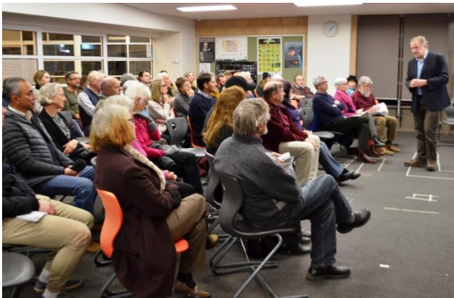
The koala forum audience