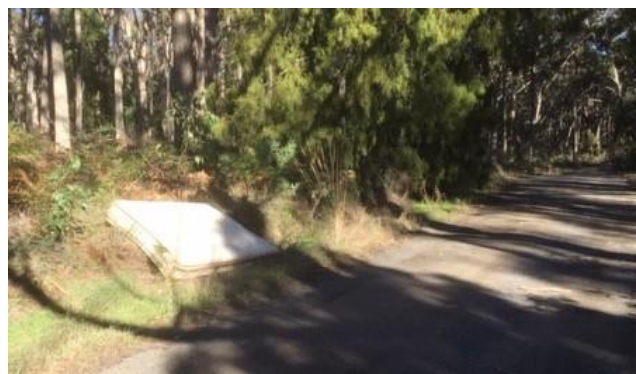
Mattress Boundary Rd 11 June 2019

http://www.focc.asn.au/wp-content/uploads/2017/05/surveyors-map-sm.png