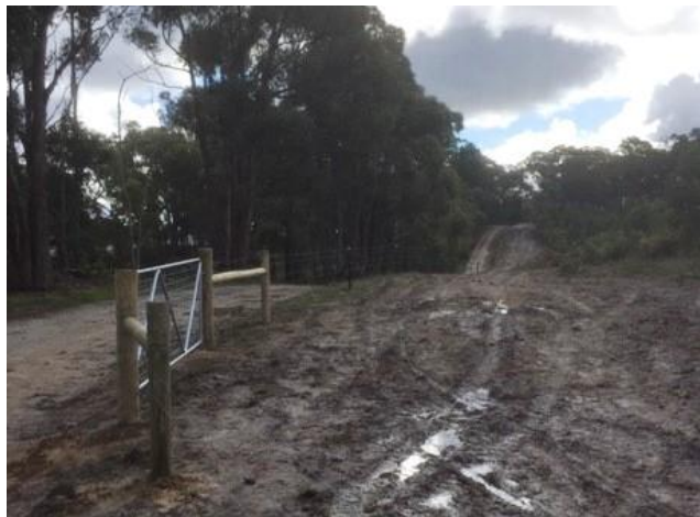
The fencing under construction with muddy seed bed

a protective fence was erected recently together with information signage. The changes will not impact residents, park visitors or emergency services.