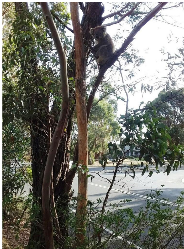
A Koala next to Geelong Rd. April 30 th 2019.

If you see koalas please record time, place and hopefully an image. Send to focinfo@gmail.com