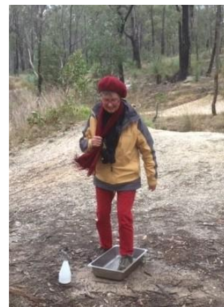
Keeping Phytophthora at bay

The walkers at the start just before dipping their boots onto the anti Phytophthora solution in the centre tin tray.