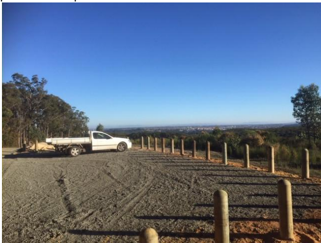
The Lookout parking area 21 st May 2019

Parks Victoria staff and contractors have constructed the first specific visitor infrastructure in the Park. Contractors over the last couple of weeks have been busy creating the parking area at the lookout and installing bollards around the area. The section of Bakers Rd from the South gate to the lookout has been upgraded with culverts and drainage works and topped with basalt surfacing. During the works a large amount of illegally dumped building dirt was removed. The lookout car park is also the planned start point for the PMP trail.