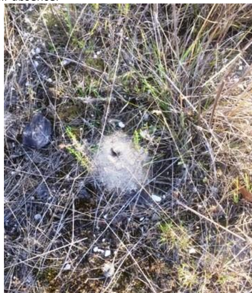
Small ant nest east of Dozed Road. May 23 rd 2019.

Last year the notion that ants were absent from the revegetation areas was raised and at first, evidence pointed to their absence.