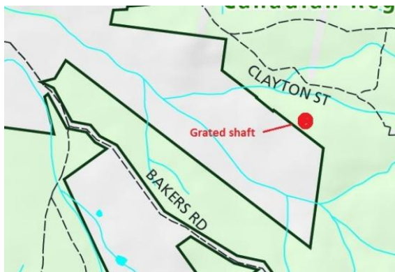
Location of shaft

A very deep shaft in the Saw Pit Gully area adjacent to the Rifle Range was capped during January. There are now seven grated mine shafts in the park. Several other dangerous shafts have been capped and covered.