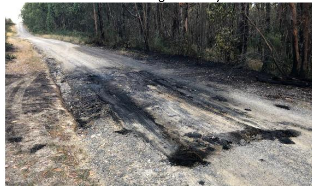
Where the fire took hold overnight.

Another car was torched in the Park in Wilson St adjacent to the CHW water tanks.