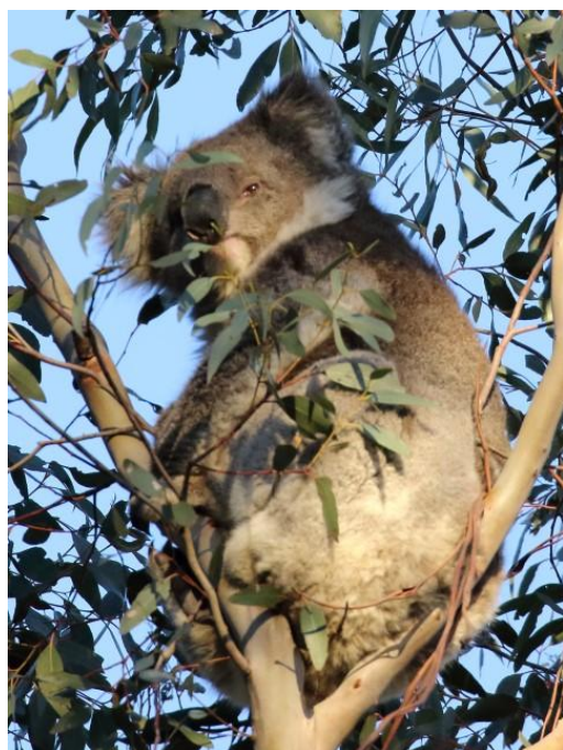
Sailors Gully Sunday Oct 28 th .

Mating season for Koalas is just beginning now and there are good chances that the grunting of a male Koala may be the first indication that Koalas are around.