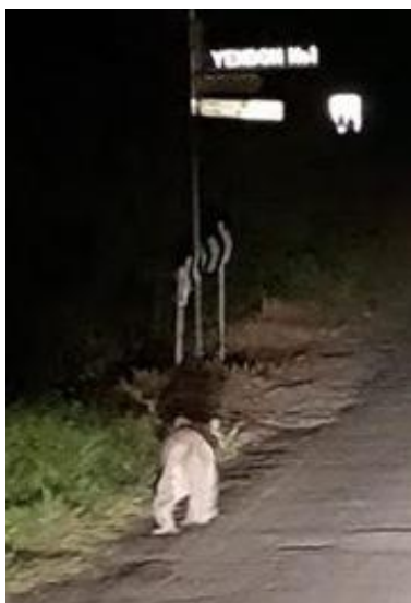
Yendon No 1 Rd. Sunday Oct 28 th Image Ben McAdie