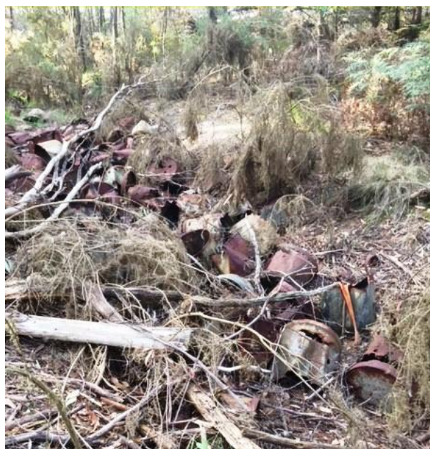
Old nightsoil cans on the northern boundary of the Park

Our park just seems to have many treasures within its boundaries, some more valuable than others.