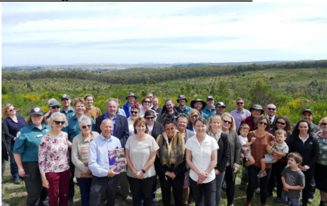
Attendees at the Park plan launch.