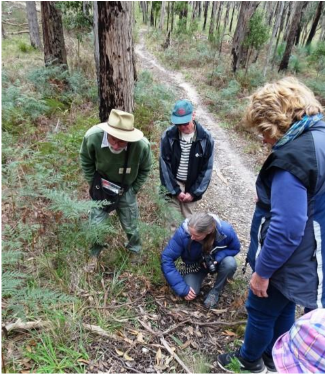
Along the trail.