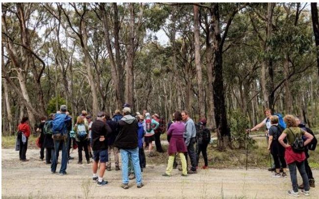
Ballarat Bushwalking group at the Wildflower Trail Tuesday Oct 23 rd