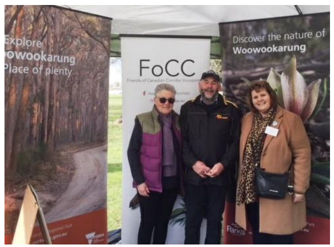
Woowookariung Regional Park was on display.