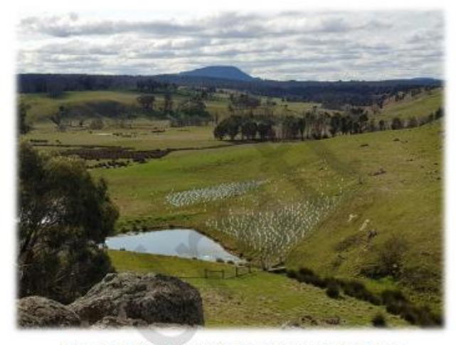
Bunanyung is the Wadawurrung spelling for Mt Buninyong and is described as a "man lying on his back with knees raised (from shape of the hill)".

Establishment Document and Strategic Plan