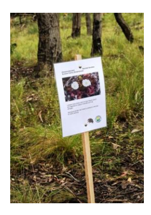
Pop up wildflower ID

The trails is on bush tracks and solid footwear and appropriate clothing is advised. The trail does involve decending into a bush creek area and has some steep sections.