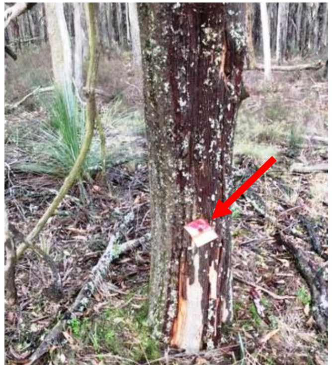
Rifle Range marker

The ex Commonwealth Rifle Range was originally fenced around its perimeter. On the east side there was a defined drop range for stray bullets. There are still a few markers left, if you can find them. The marker below is just off the Boundary Rd and Davidsons Rd junction.