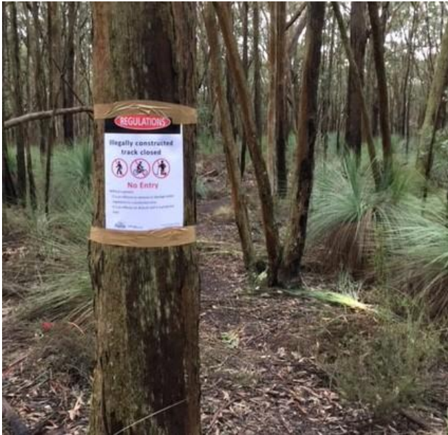
The closed track sign

In the June News Update readers were alerted to an illegal track cut through grasstrees. Parks Victoria Rangers have now closed the track.