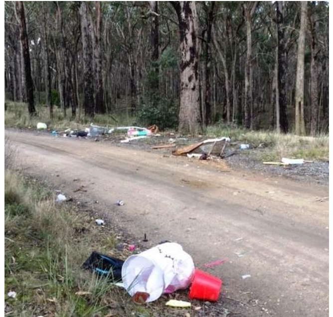
Rubbish strewn along Wilson St

investigation. Many personal identity items were left in the rubbish.