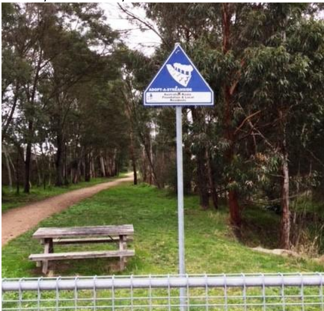
The Koala sign in Warrenheip Gully at the Kline St crossing