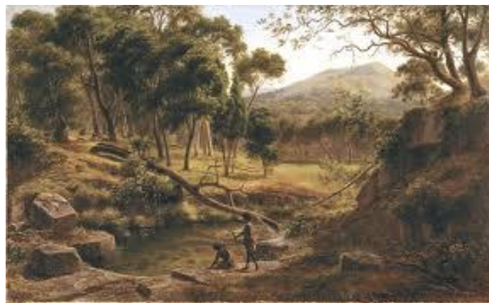
E Von Guerard, Warrenheip Hills near Ballarat 1854.

The Friends of Canadian Corridor have Von Guerard to thank for the wonderful painting of the background (Woowookarung) Forest and the painting of Mt Warrenheip