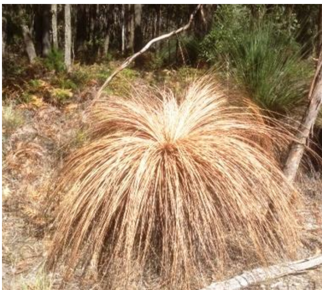
A dead grasstree on Boundary Rd - A Phytophthora victim?

He will present on the threat “phytophthora” presents to the Parks well being.