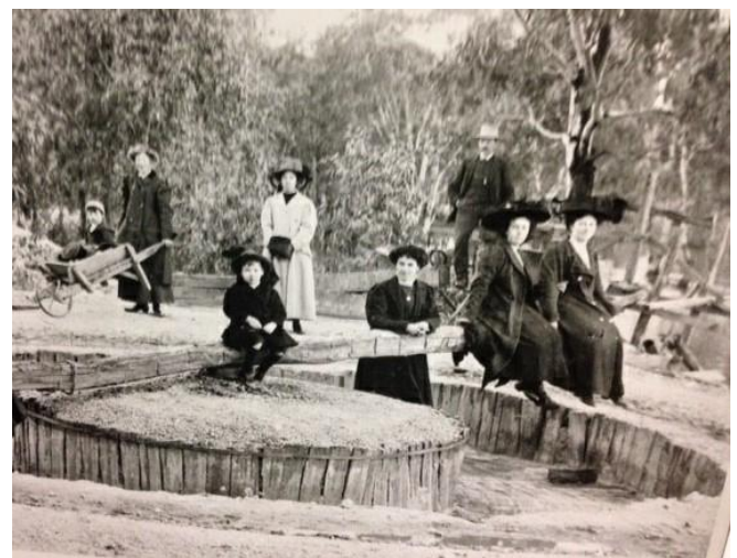
The horse puddler in the early days according to locals.

The Sailors Gully Neighbourhood group has a Facebook page and is planning a program of activities. More details when available.