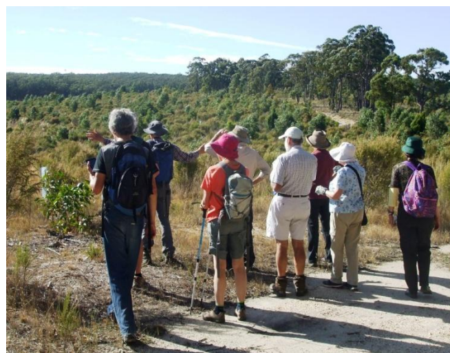
The ramblers surveying the tree planting area

Walkers counted the planted trees and determined the survival rate. Of the 260 trees planted, 200 are going strong, 12 are struggling and 48 have not survived the hot summer. An excellent result for the walkers and the trees. Many thanks to John Petheran for organising the count.