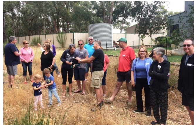
Sailors Gully Neighbourhood neighbours meeting together at the site of the Horse Puddler

residents of the Sailors Gully area met to discuss issues effecting their area and to workshop ideas to improve their local environment. After the meeting, the group walked to the site of the Mt Clear diggings horse puddler relic. The horse puddler site is one of Ballarat’s early gold mining relics and is situated in the Sailors Gully area. The site is historically significant and is registered with Heritage Victoria.