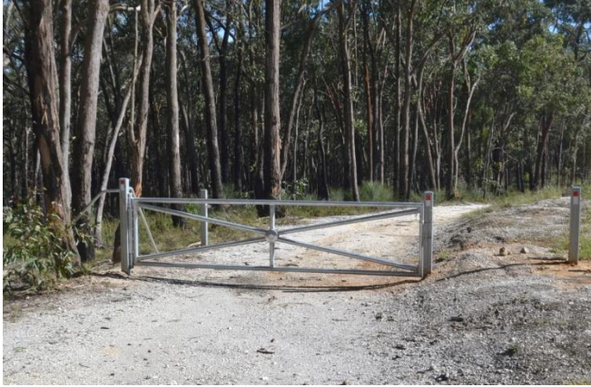
The new heavier gate