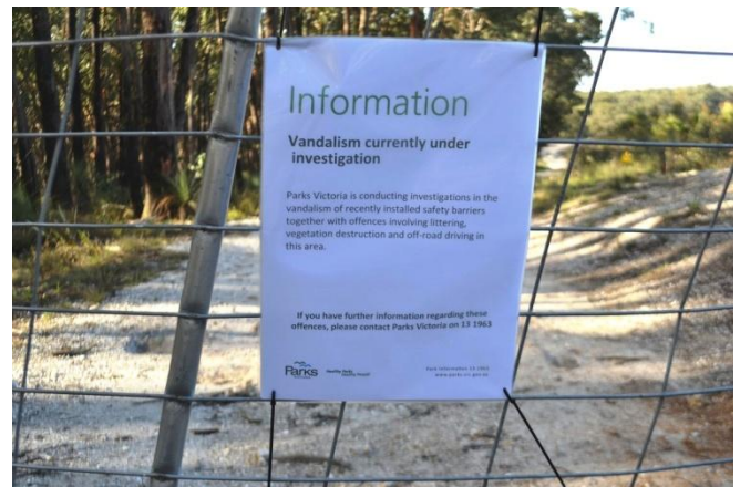
Parks gate sign