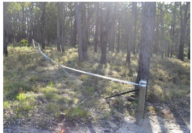
The broken fence with incident tape