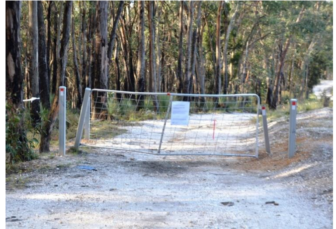
The badly damaged gate

Parks Victoria have been given a vehicle description and identification.