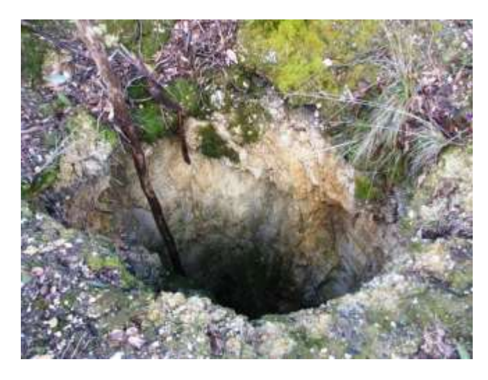
Mineshaft south of the Wilson St water tanks

covered many mine shafts. Over time the timber base covers have rotted and collapsed leaving crumbling edges and an exposed shaft. This shaft below is over 20 metres deep.