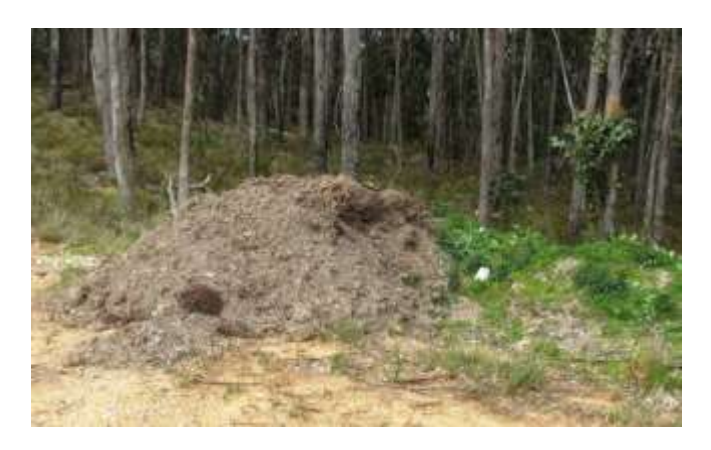
A large truckload of recently dumped garden soil next to a similar previous dump which is now covered in weeds.

Rubbish is continuing to be dumped in the Park. On one weekend recently ten (10) separate dumps occured. If a dumper is spotted please call Parks Victoria on 131 963 with the details. Number plate details are very valuable.