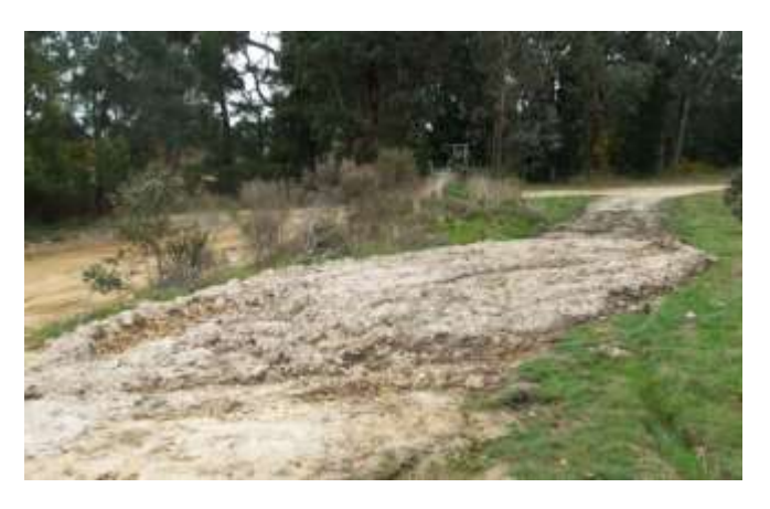
Dumped spoil in the Park

Recently a large amount of earth spoil was dumped in the Park and an adjacent ex - plantation fire trail was subject to earth removal and then filled in with imported road surfacing. Parks Victoria and the City of Ballarat are now conducting investigations.