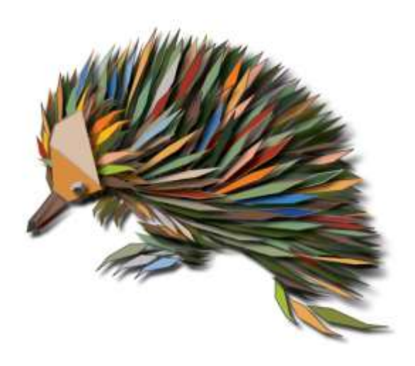
Spikey: Created by M Rootes

Meet Spikey our FoCC logo star. Spikey's many relatives live in the park. Echidna diggings can be seen in many places and occasionally a digging echidna can be found.