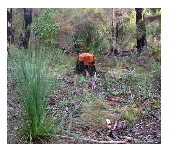
Illegally felled tree