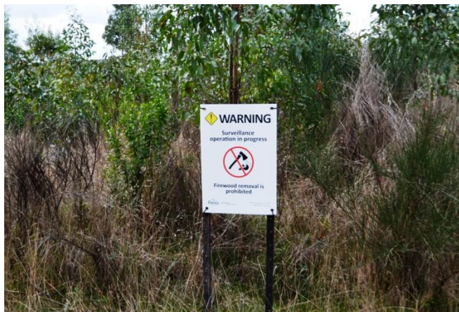
Sign at entrance to park corner Elsworth St and Bakers Rd

Surveillance and no firewood collection sign off Bakers Rd.