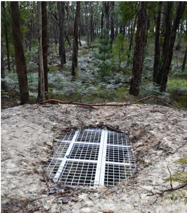
South of Bakers Rd August 2017.