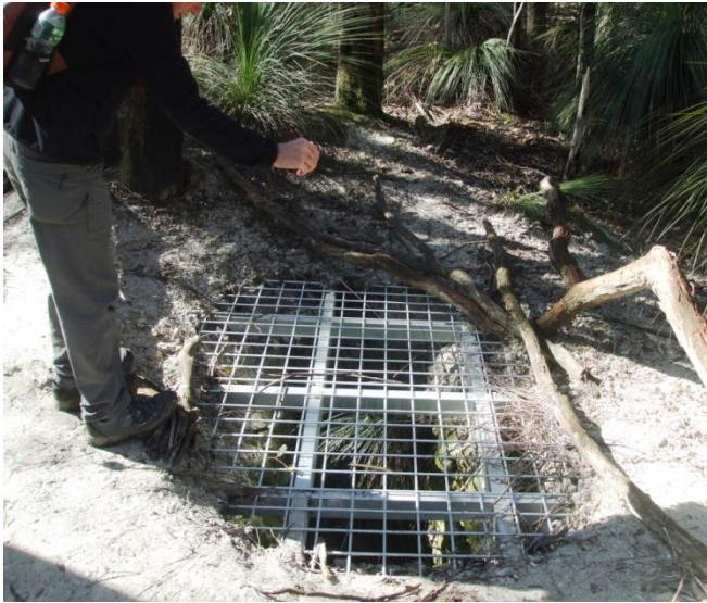
Grated mine at Billy Cart Hill Aug 2017.